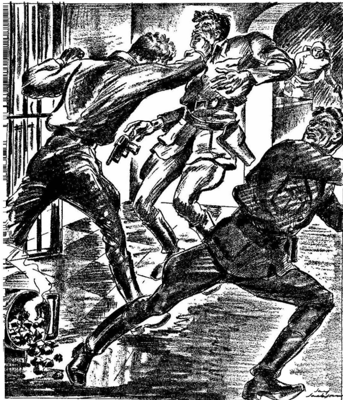
Young Harker lashed out with his fist and hell broke loose

The idea was to make a man out of young Harker, but not with a stunt as real as this one was . . .