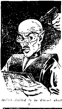
Jackson decided to be discreet about it...

Gor-T; don't let the old judge fool you. I agree with you about that yarn—I'll bet half of our subscribers will trade their printies in for new models, figuring their sets have gone haywire, when that story comes through."