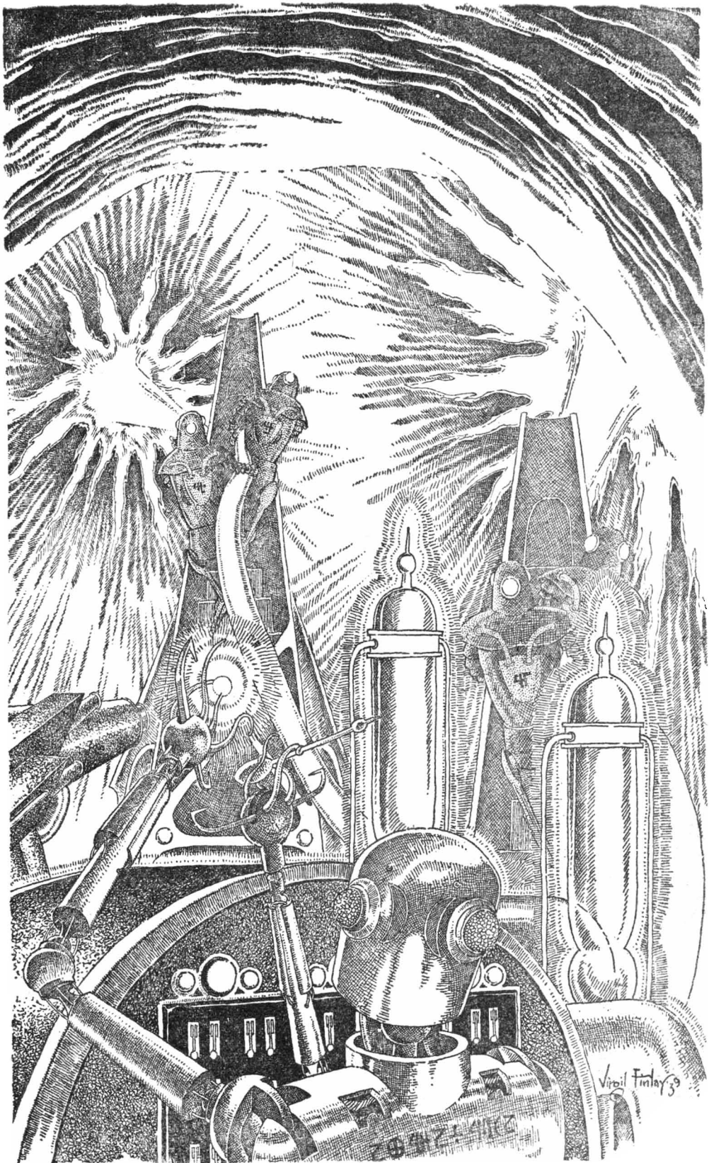
Efficiently, a shaft was sunk and the disintegrator corps began to drive the long tunnel!