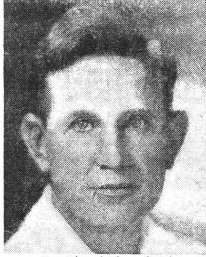
Dr. Edward Elmer Smith

N EWSSBOY, water-boy, camp flunkey, lumberman, riverman, miner, surveyor, harvest hand, carpenter, cook, electrician, engineer. Then, after being partially educated, junior chemist, assistant chemist, cereal technologist, associate chemist, chief chemist, superintendent of production, doughnut specialist. How can a guy do justice to over a hundred jobs in a short squib?