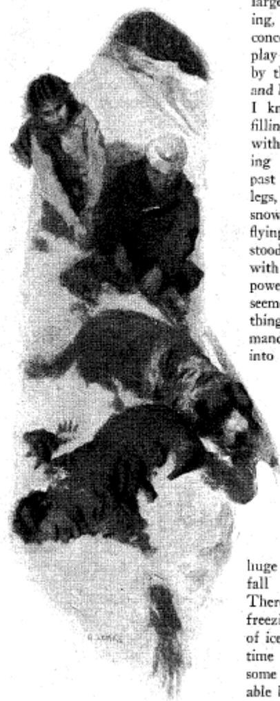
"HIS TEETH FASTENED UPON THE DOOR AND SKEL-STRAPS. WE PULLED TOGETHER"

"The door's blown open!" cried the uncle. "For God's sake—"