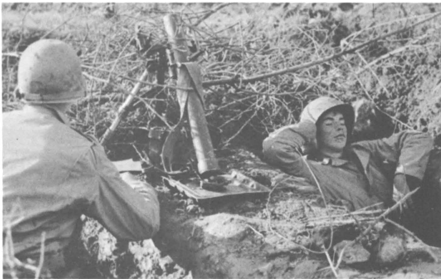
Crewman rests while buddy is ready to defend 36th's attacking companies.