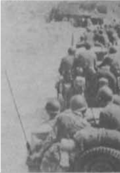
Eisenhower and General Mark Clark survey beachhead as supporting troops take over bloody Salerno.