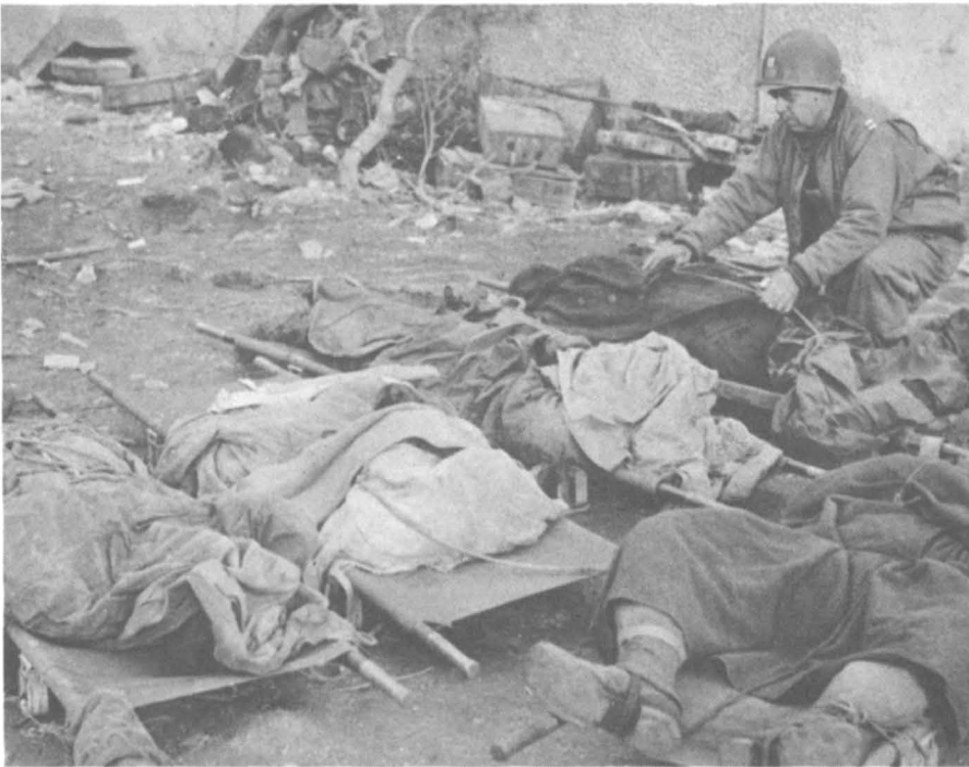
Chaplain of 1st Battalion, 141 Infantry Regiment, covers one of the bodies during evacuation of American dead to 36th Division cemetery at Paestum.

ing apart at its seams. Hastily, they tried to reload, but an 88 shell crashed nearby and shrapnel smashed into their gun sight, knocking it out of commission.