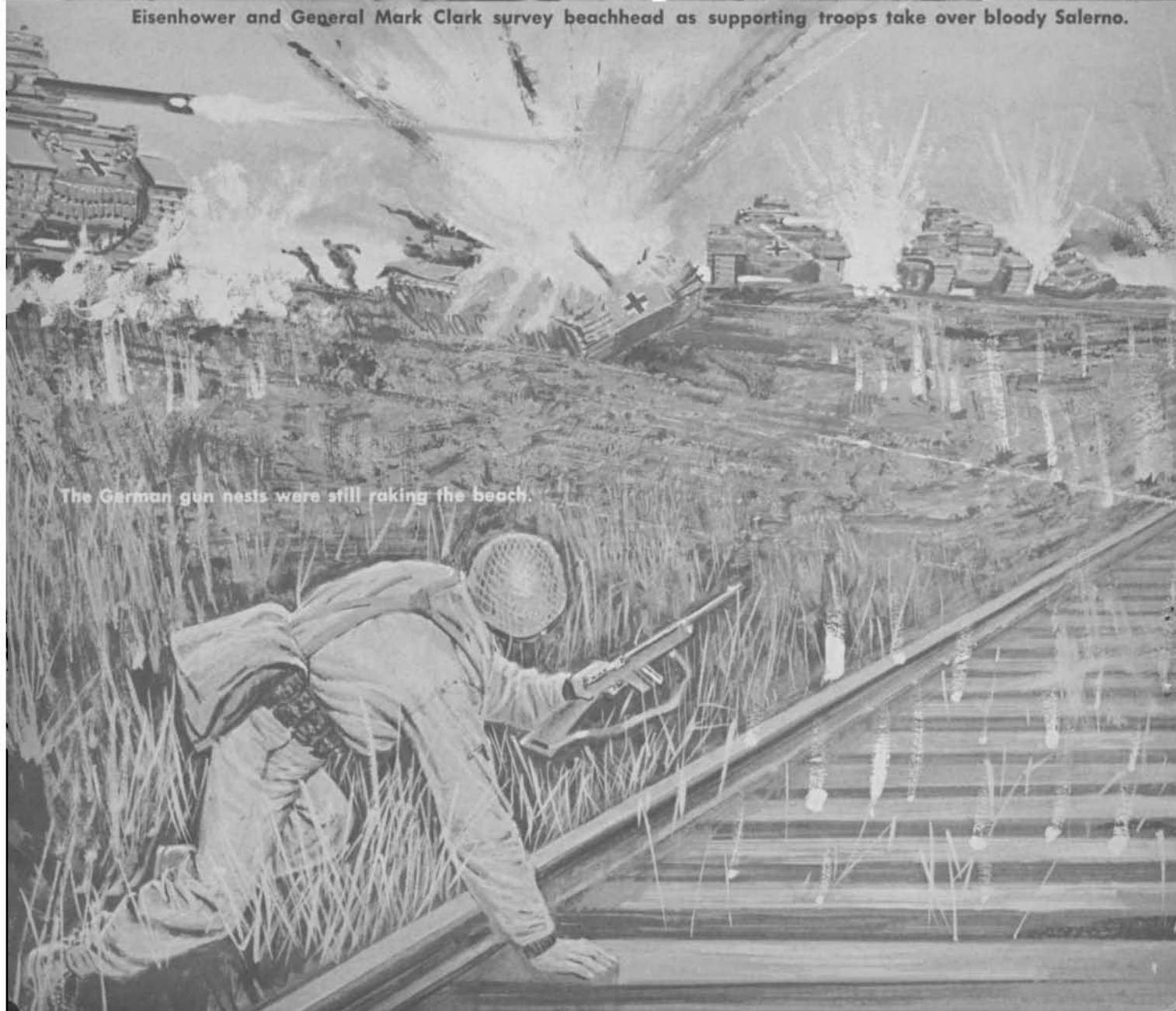
The German gun nests were still raking the beach.