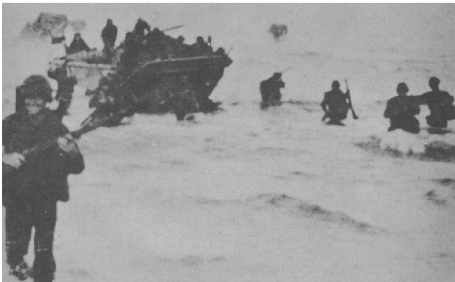
First wave of Texans hit the beach under German fire.

The British, which included the 46th (Pine Tree) Division and the 56th (London) Division, were to land