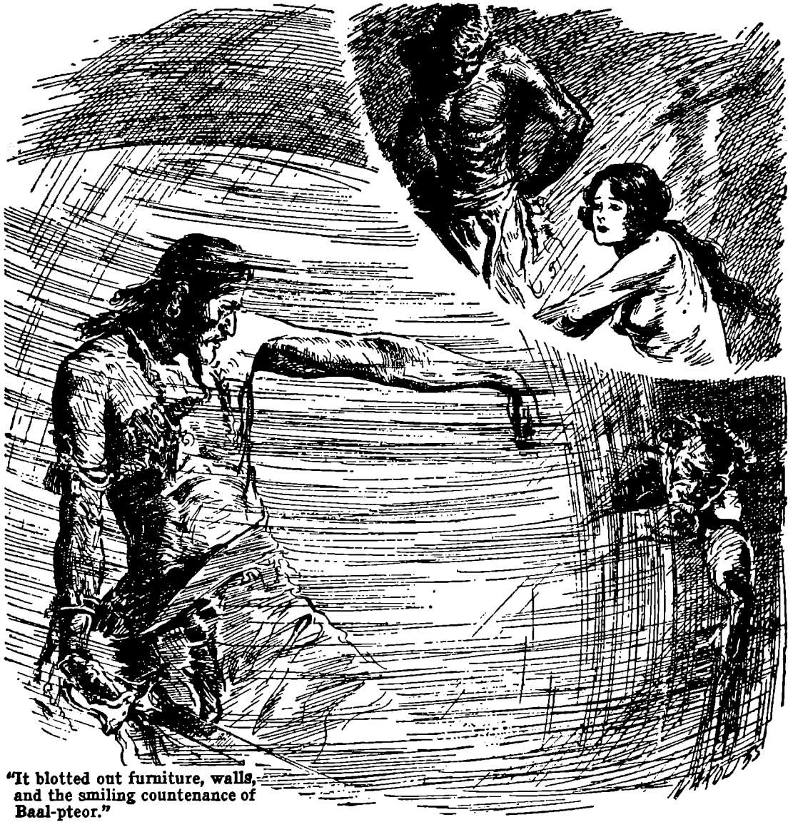
"It blotted out furniture, walls, and the smiling countenance of Baal-pteor."

brown and black folk mingle together to produce hybrids of all unholy hues and breeds—who can tell who is a man, and who a demon in disguise? Aram Baksh is a demon in the form of a man! At night he assumes his true guise and carries his guests off into the desert where his fellow demons from the waste meet in conclave."