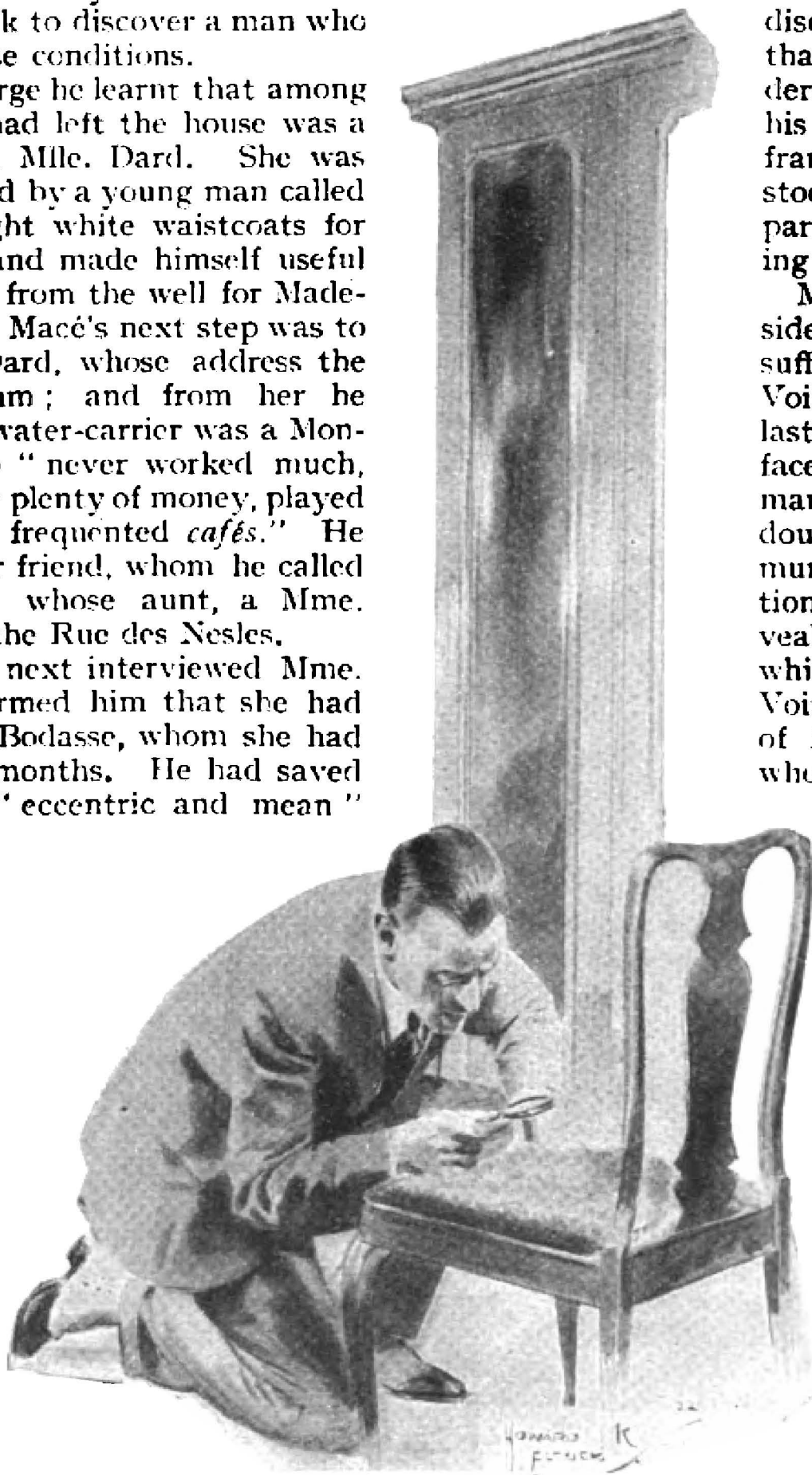
The keen eyes of a detective observed faint white marks which suggested to him the figures 39 reversed. How could they have come there?

It now only remained to prove the dismemberment, and Voirbo's actual handiwork in it; and for this purpose the prisoner