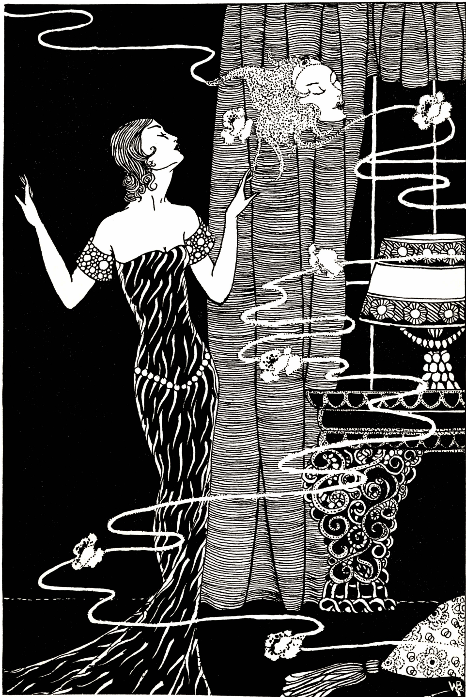
A light step on the stair, a lighter hand on the door, and Lalage entered