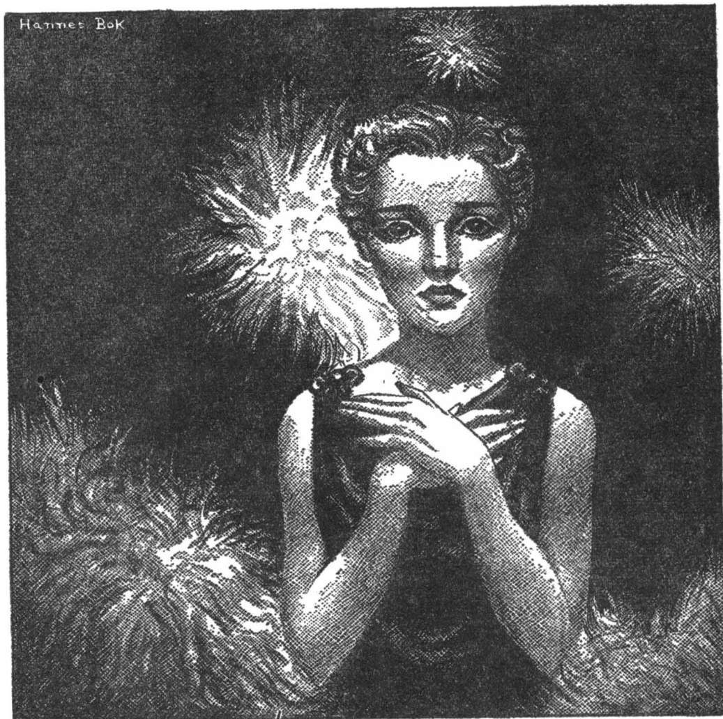
"There was a curious vague fixedness in her stare."

He made up his mind quickly. He could always locate bearer number one; he would follow bearer number two.