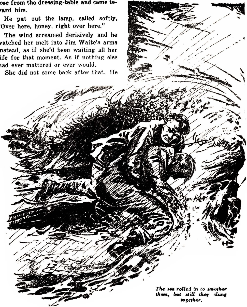
The sea rolled in to smother them, but still they clung together.

was alone with the sea and the rain, the cramps and the cold. And finally the fear, the numbing fear that all the world must be ocean. Even Jim Waite was better off than he.