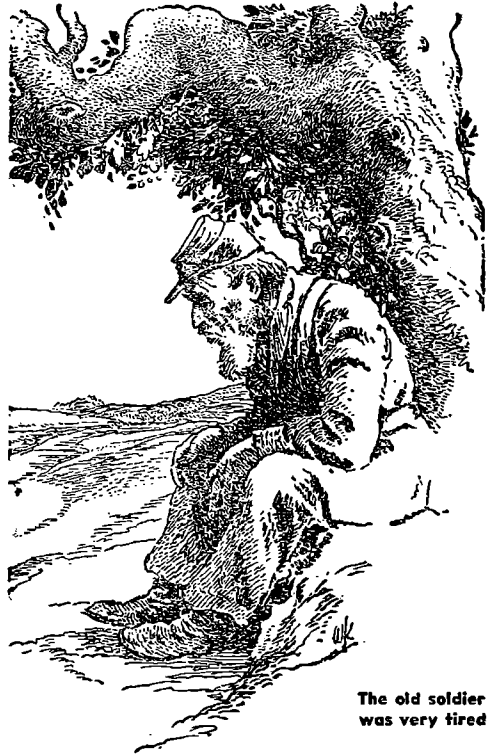
The old soldier was very tired

Now, as much alone as when he first awoke in that bloody sunset so long ago, he leaned against a tree and stared at the placid water. Even the creek had a purpose and a