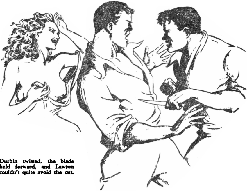
Durbin twisted, the blade held forward, and Lawton couldn't quite avoid the cut.

Lawton flushed; he resented having anyone sorry for him. Then her loyalty touched him. "You better run along," he answered gently.