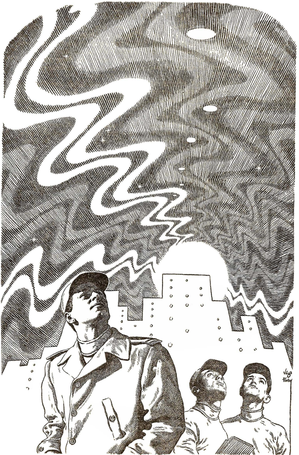
The dome became a riot of flaming green