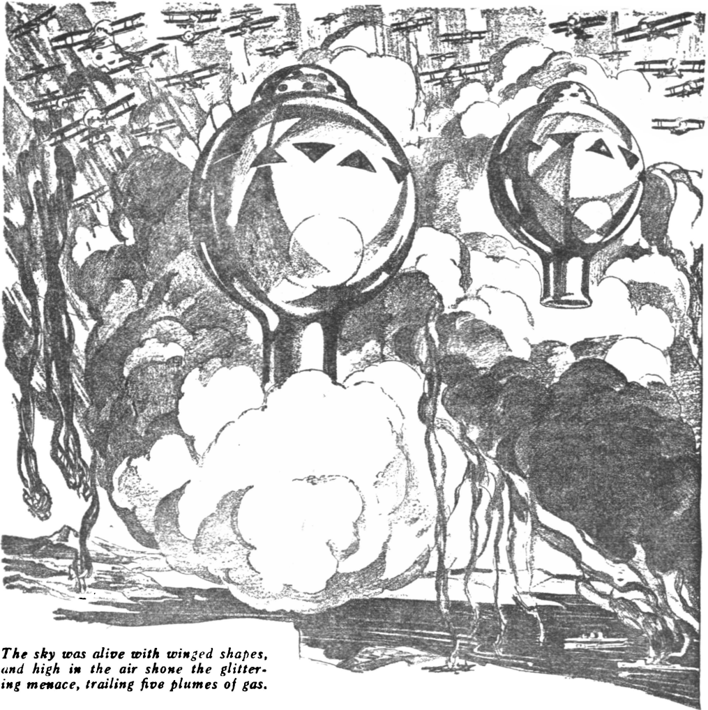
The sky was alive with winged shapes, and high in the air shone the glittering menace, trailing five plumes of gas.