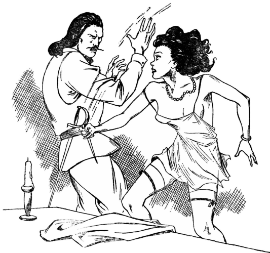
The girl swung viciously, and there was a dagger in her hand.

He grasped the girl in his arms, and felt her own tighten about his neck. He heard her quickened breathing, the soft whisper: