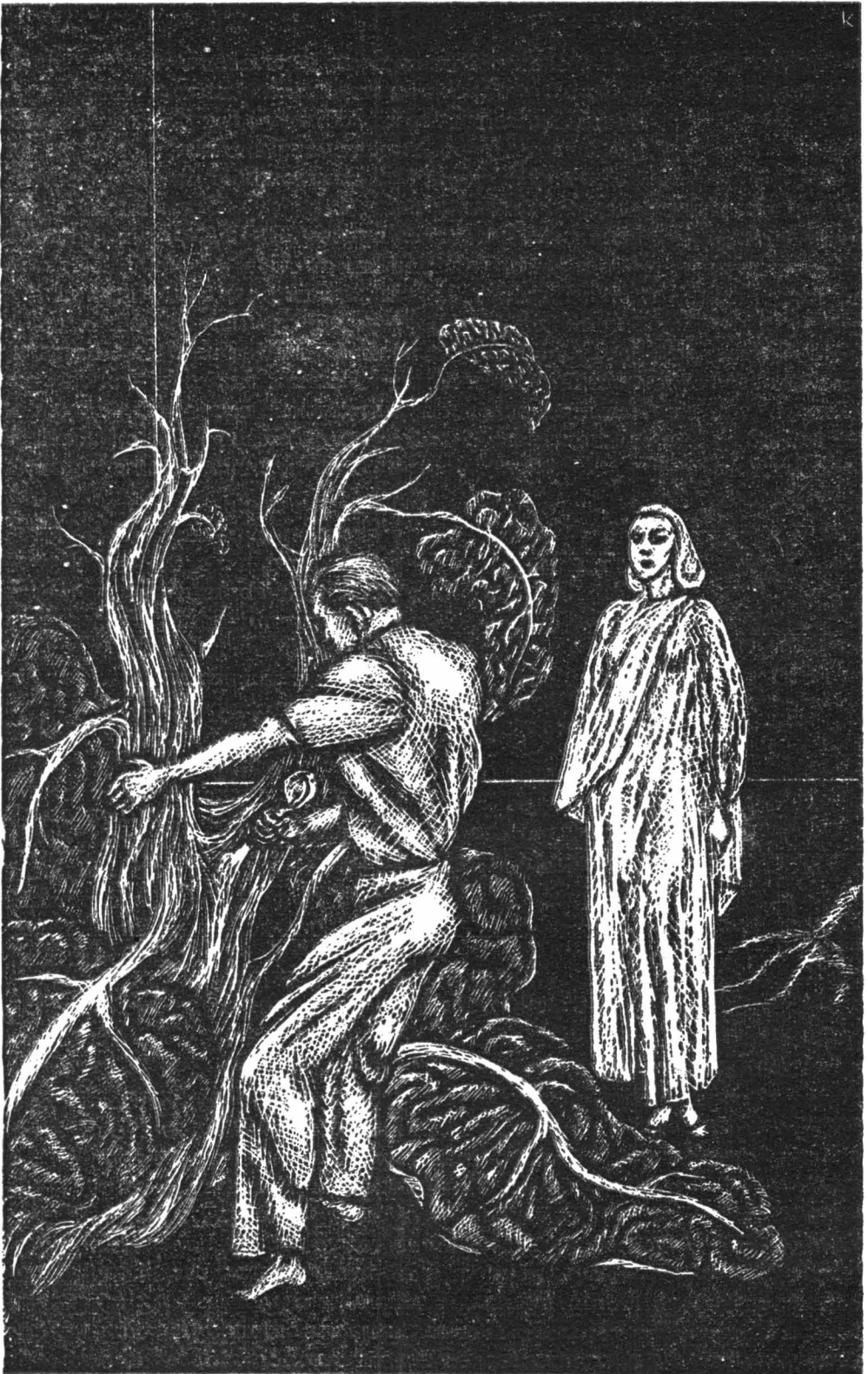
This time I tugged with all my strength.