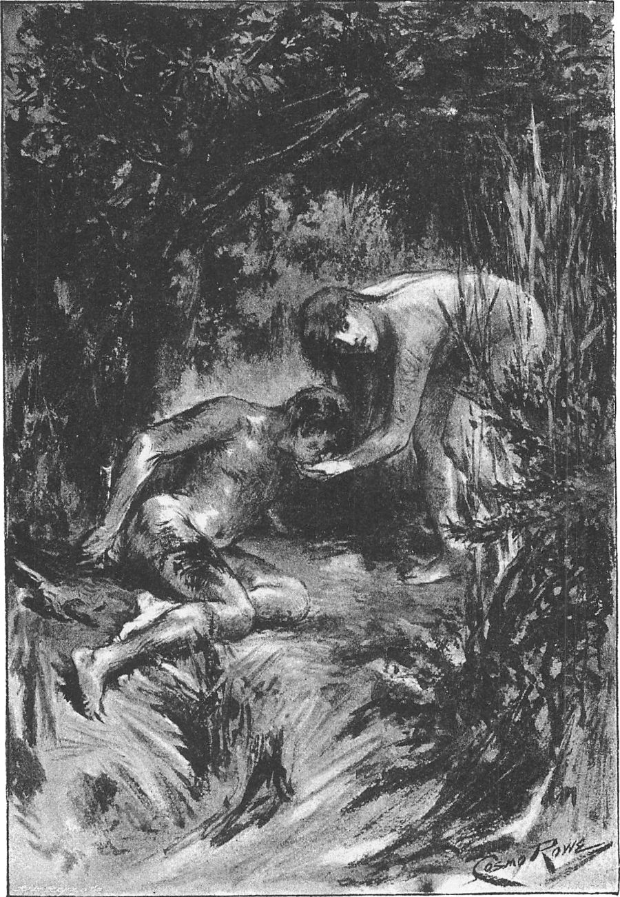
Eudena brought him plenty in her hands.