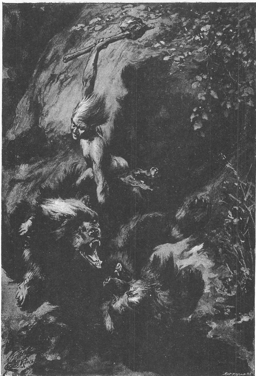
He was hanging to its back half buried in fur.