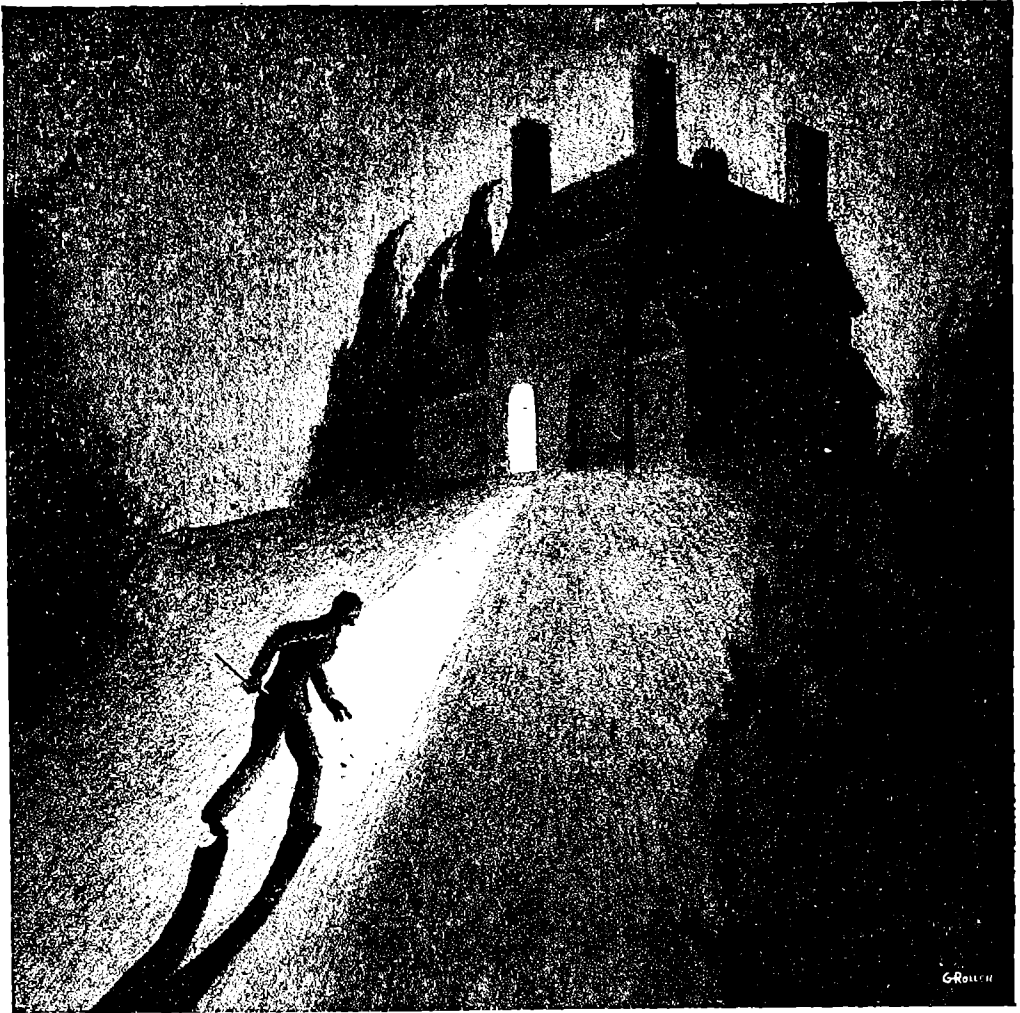
Table for Two

"His palm was sweaty, gripping the knife he'd picked up out of the sand . . ."