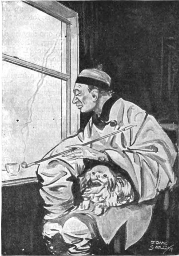
"Sitting by the window, his subconscious mind centered on his tao "

merit so as to reach his tao , beyond the good and the evil?