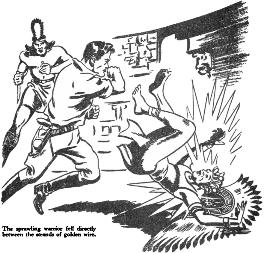
The sprawling warrior fell directly between the strands of golden wire.

through underbrush. The hammer clicked on a spent shell and Dick fumbled in his pocket for the half-dozen extra cartridges he had been wise enough to bring from the camp of the Courtney Archeological Expedition.