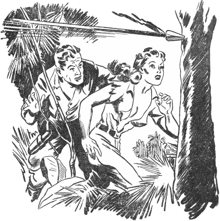
A spear slammed into a tree as they ran.

T HE golden light increased as they descended, bathing them in its warm glow. The air was fresh and scented subtly with some unfamiliar perfume. The hum of machinery grew louder. Dick felt invigorated, as he had often felt in power plants, where high-frequency current made the nerve-ends tingle.