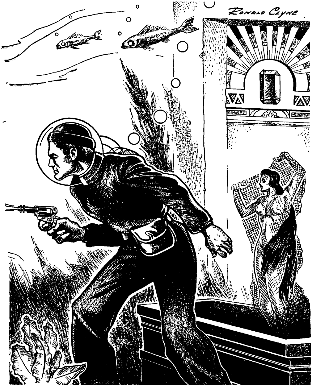
Lundy fired the last shot in his gun.

He'd been screaming a long time. Ever since the shot of avertin Lundy had given him after he was taken had begun to wear thin. Fighting the straps and