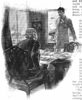
"A YOUNG MAN SPRANG INTO THE ROOM, LEAVING HIS AEROCAR OUTSIDE."

"Hum, it hasn't affected your appetite, at any rate," said the other.