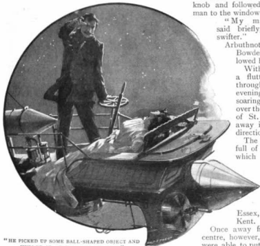
"HE PICKED UP SOME BALL-SHAPED OBJECT AND HURLED IT AT HIS INTERRUPTERS."

A huge full moon was just appearing above the horizon, and its pale beauty was reflected in touches of silver on the darkening sea. Far above them a few aerocars wafted their way towards their various destinations, and the alert customs officers in their crimson-painted machines flitted restlessly hither and thither.