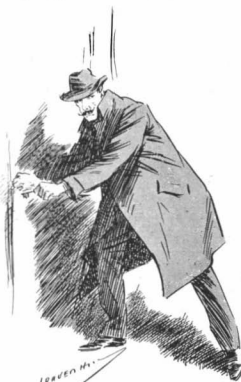
"I was inside the old curiosity shop."

prepared to open either with the false keys in my possession, or, at worst, take an impression of the keyhole and trust to my Anarchist friend for the rest. But, to my amazement, I discovered all the papers pertaining to the concern in a desk which was not even locked. The books, three in number, were the ordinary day-book, journal, and ledger referring to the shop—book-keeping of the older fashion; but in a portfolio lay half-a-dozen foolscap sheets, headed "Mr. Roger's List," "Mr. Macpherson's," "Mr. Tyrrel's," the names I had already learned, and three others. These lists contained in the first column, names; in the second column, addresses; in the