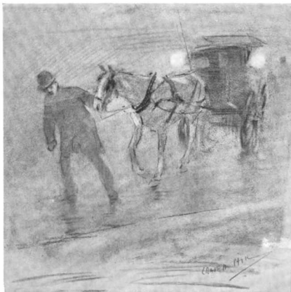
"The cabmen were leading their animals slowly along."

answer any more questions than they're asked, and Mr. Summertrees has been a good customer at the United Capital for many years."