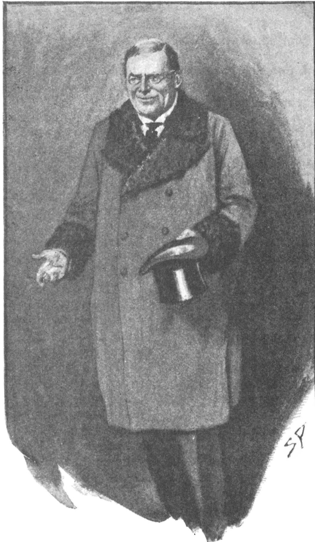
"CHARLES AUGUSTUS MILVERTON."

"My dear sir, it is painful to me to discuss it; but if the money is not paid on the 14th there certainly will be no marriage on the 18th." His insufferable smile was more complacent than ever.