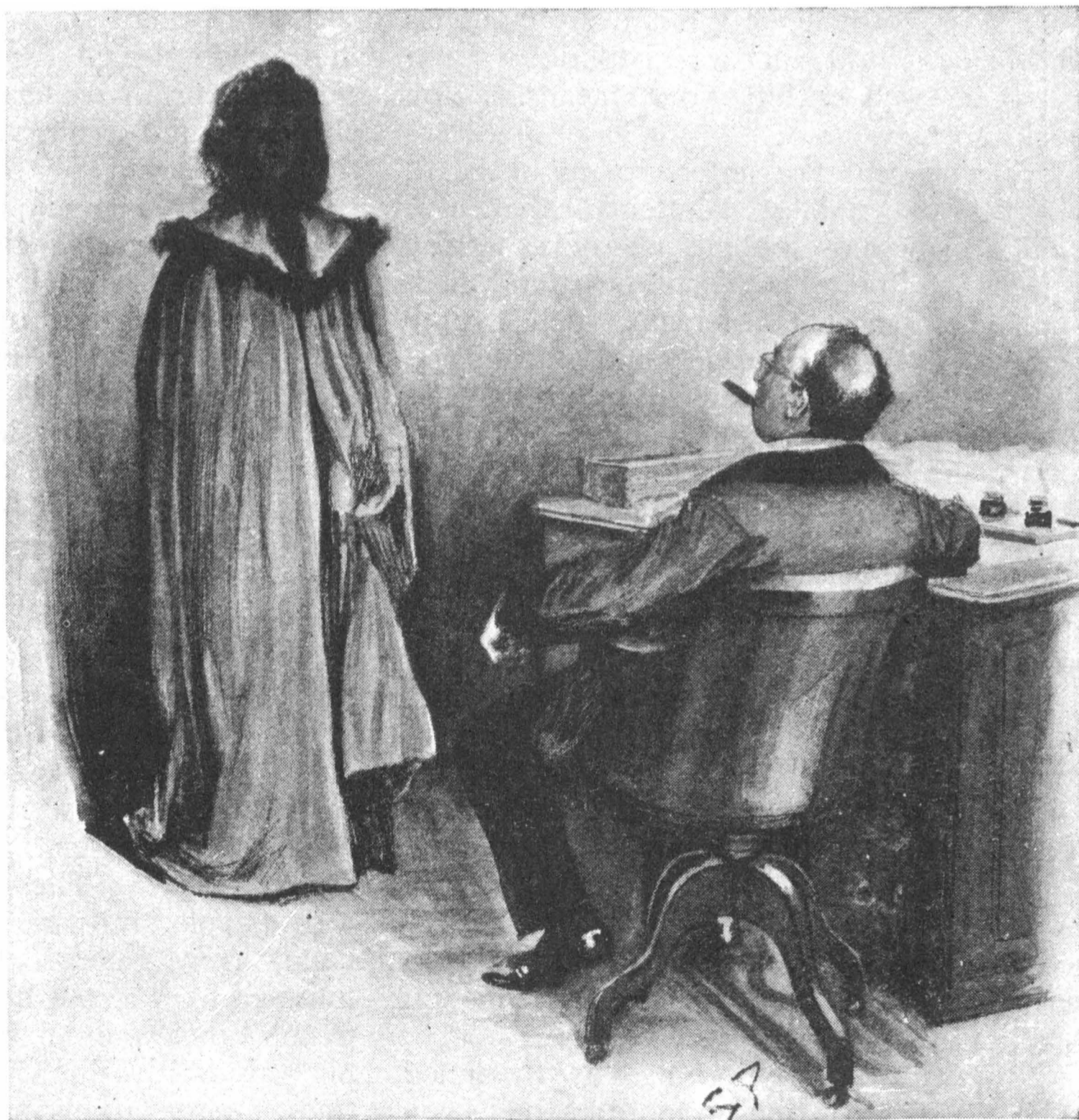
"YOU COULDN'T COME ANY OTHER TIME—EH?"

"Well," said Milverton, "you've made me lose a good night's rest, my dear. I hope you'll prove worth it. You couldn't come any other time—eh?"