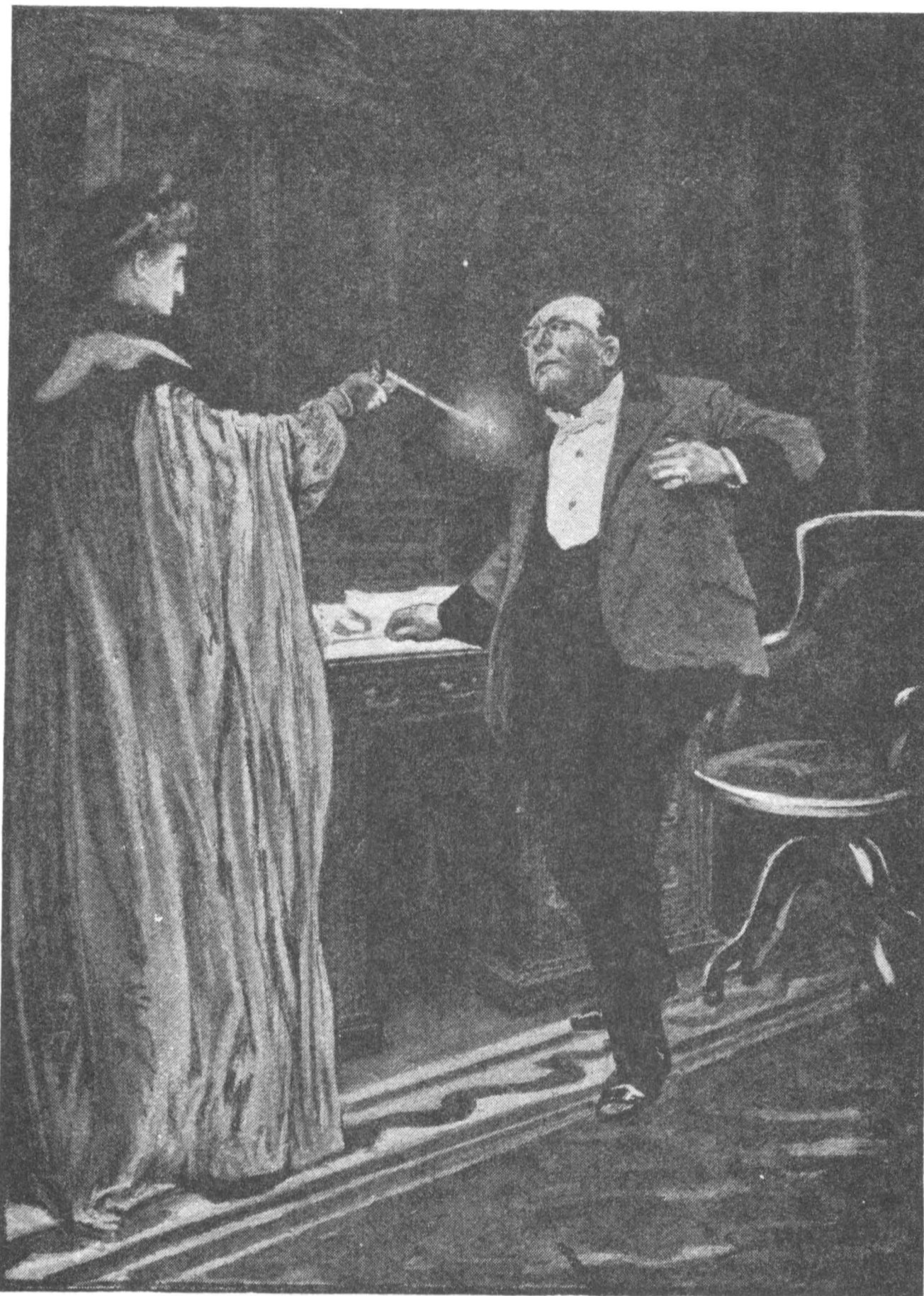
“ THEN HE STAGGERED TO HIS FEET AND RECEIVED ANOTHER SHOT.”

wall which barred our path, but he sprang to the top and over. As I did the same I felt the hand of the man behind me grab at my ankle; but I kicked myself free and scrambled over a glass-strewn coping. I fell upon my face among some bushes; but Holmes had me on my feet in an instant, and together we dashed away across the huge expanse of Hampstead Heath. We had run two miles, I suppose, before Holmes at last halted and listened intently. All was absolute silence behind us. We had shaken off our pursuers and were safe.