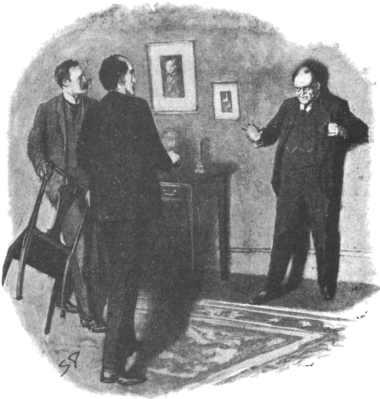
"EXHIBITING THE BUTT OF A LARGE REVOLVER, WHICH PROJECTED FROM THE INSIDE POCKET."

and it is a long drive to Hampstead." He stepped forward, took up his coat, laid his hand on his revolver, and turned to the door. I picked up a chair, but Holmes shook his head and I laid it down again. With a bow, a smile, and a twinkle Milverton was out of the room, and a few moments after we heard the slam of the carriage door and the rattle of the wheels as he drove away.