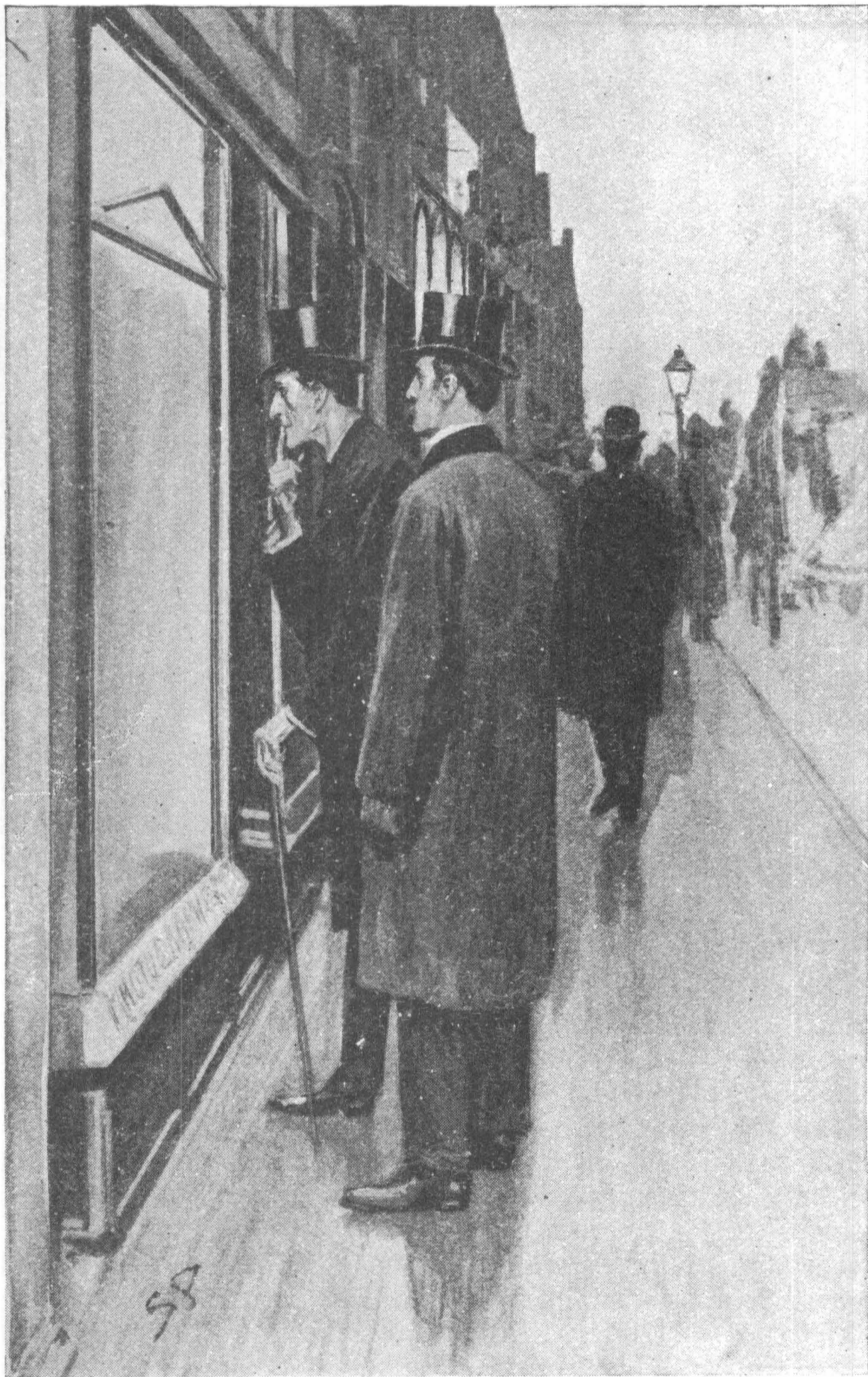
"FOLLOWING HIS GAZE I SAW THE PICTURE OF A REGAL AND STATELY LADY IN COURT DRESS."

Regent Circus. Here on the left hand there stands a shop window filled with photographs of the celebrities and beauties of the day. Holmes's eyes fixed themselves upon one of them, and following his gaze I saw the picture of a regal and stately lady in Court dress, with a high diamond tiara upon her noble head. I looked at that delicately-curved nose, at the marked eyebrows, at the straight mouth, and the strong little chin