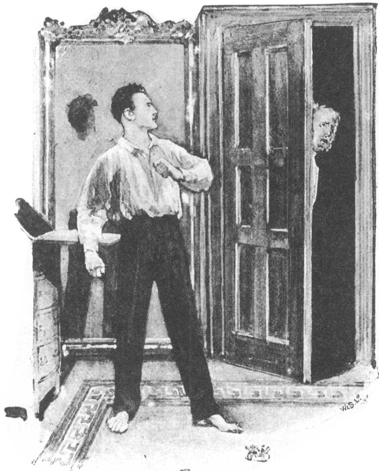
“AT MY CRY HE DROPPED IT.”

“‘Arthur!’ I screamed, ‘you villain! you thief! How dare you touch that coronet?’