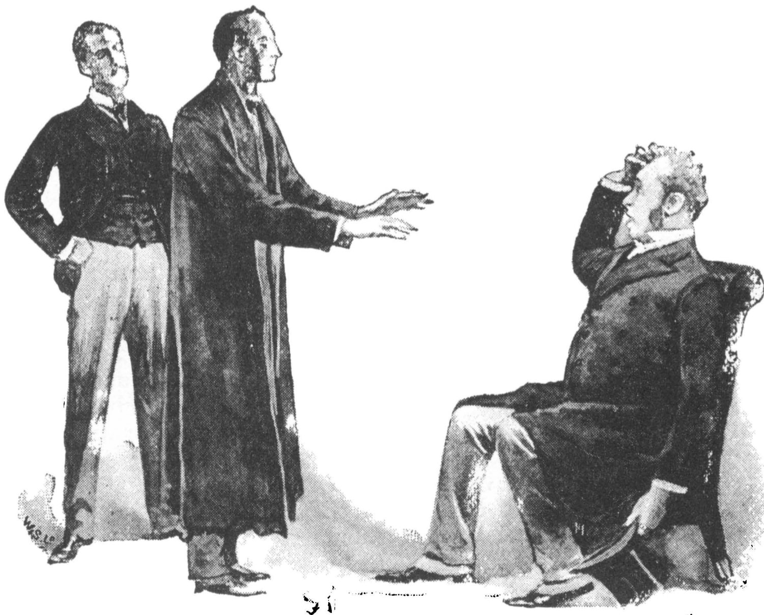
"WITH A LOOK OF GRIEF AND DESPAIR."

A few moments later he was in our room, still puffing, still gesticulating, but with so fixed a look of grief and despair in his eyes that our smiles were turned in an instant to horror and pity. For a while he could not get his words out, but swayed his body and plucked at his hair like one who has been driven to the extreme limits of his reason. Then, suddenly springing