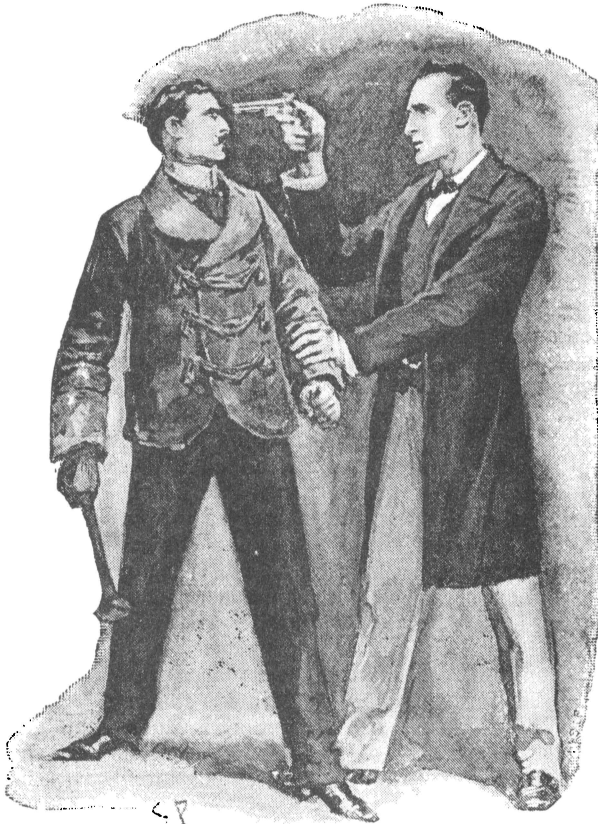
"I CLAPPED A PISTOL TO HIS HEAD."

"I think that we may safely say," returned Holmes, "that she is wherever Sir George Burnwell is. It is equally certain, too, that whatever her sins are, they will soon receive a more than sufficient punishment."