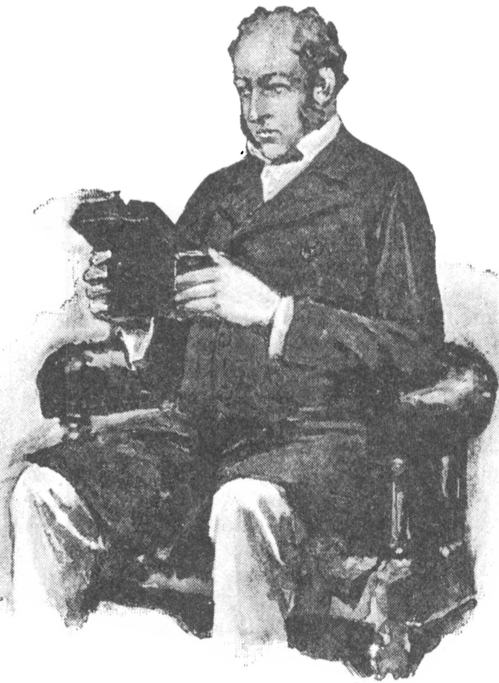
"I TOOK THE PRECIOUS CASE."

"When evening came, I felt that it would be an imprudence to leave so precious a thing in the office behind me. Bankers' safes had been forced before now, and why should not mine be? If so, how terrible would be the position in which I should find myself! I determined, therefore, that for the next few days I would always carry the case backwards and forwards with me, so that it might never be really out of my reach. With this intention, I called a cab, and drove out to my house at Streatham, carrying the jewel with me. I did not breathe freely until I had taken it upstairs, and locked it in the bureau of my dressing-room.