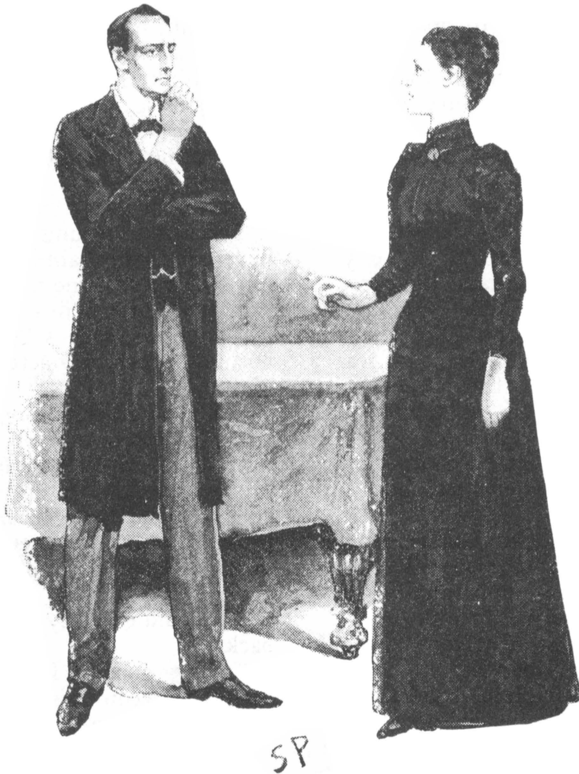
"SOMETHING LIKE FEAR SPRANG UP IN THE YOUNG LADY'S EYES."

Something like fear sprang up in the young lady's expressive black eyes. "Why,