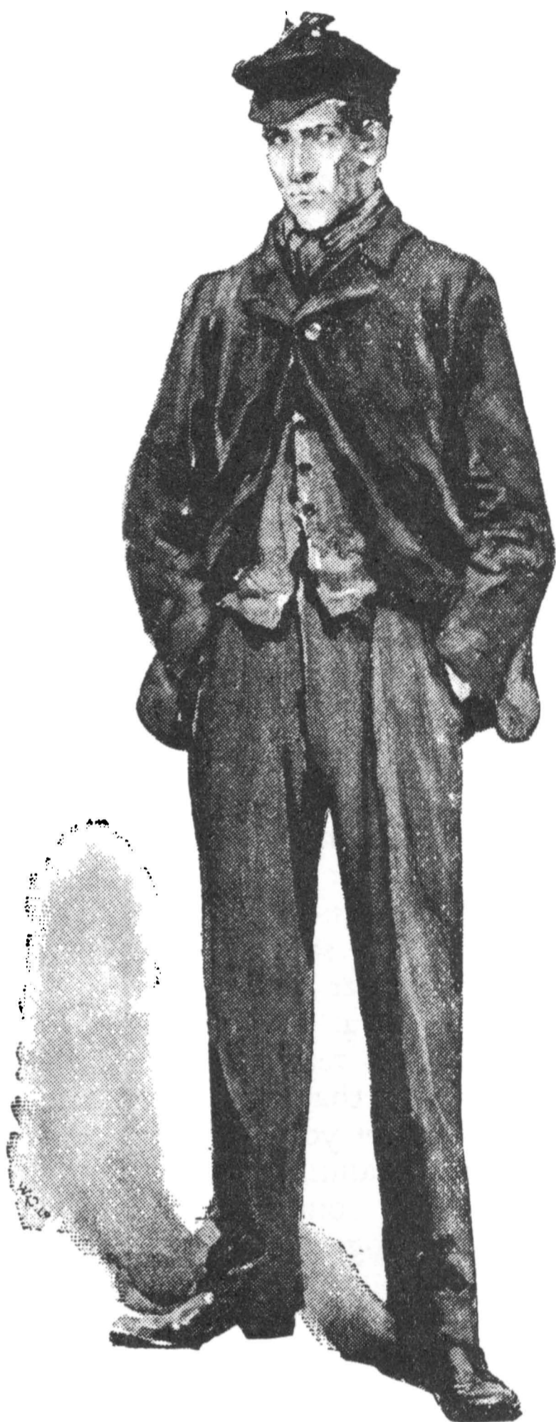
"DRESSED AS A COMMON LOAFER."

selves in our room once more. He hurried to his chamber and was down again in a few minutes dressed as a common loafer. With his collar turned up, his shiny seedy coat, his red cravat, and his worn boots, he was a perfect sample of the class.