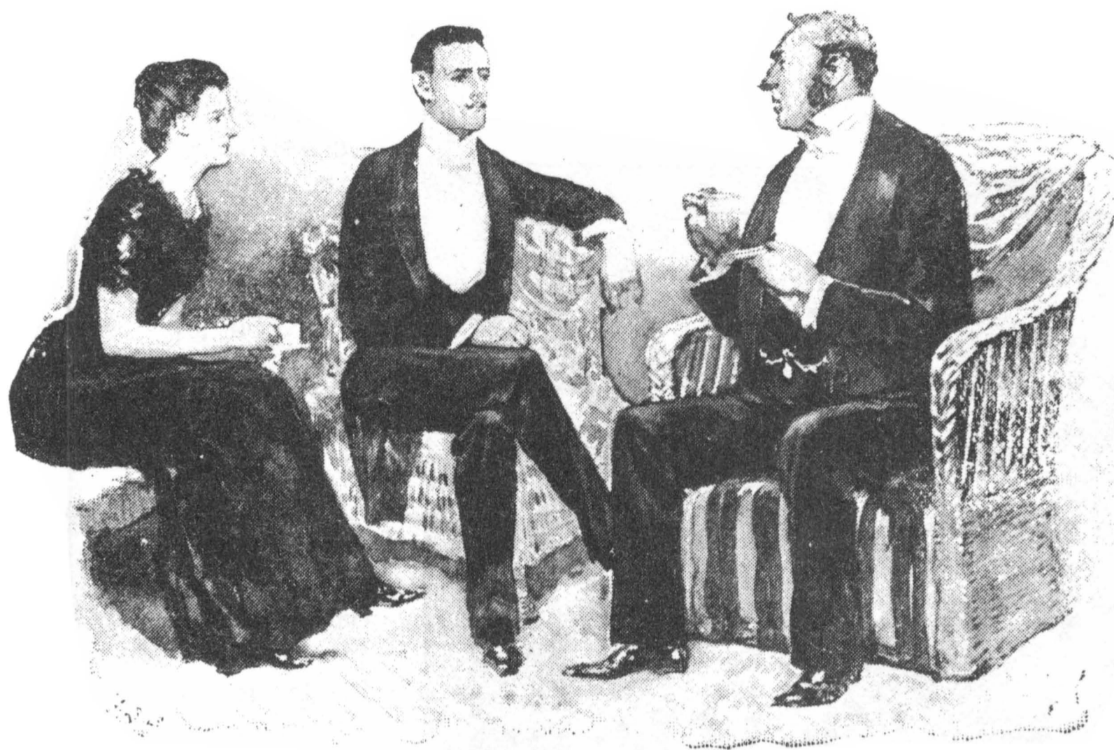
"OH, ANY OLD KEY WILL FIT THAT BUREAU."

followed me to my room, however, that night with a very grave face.