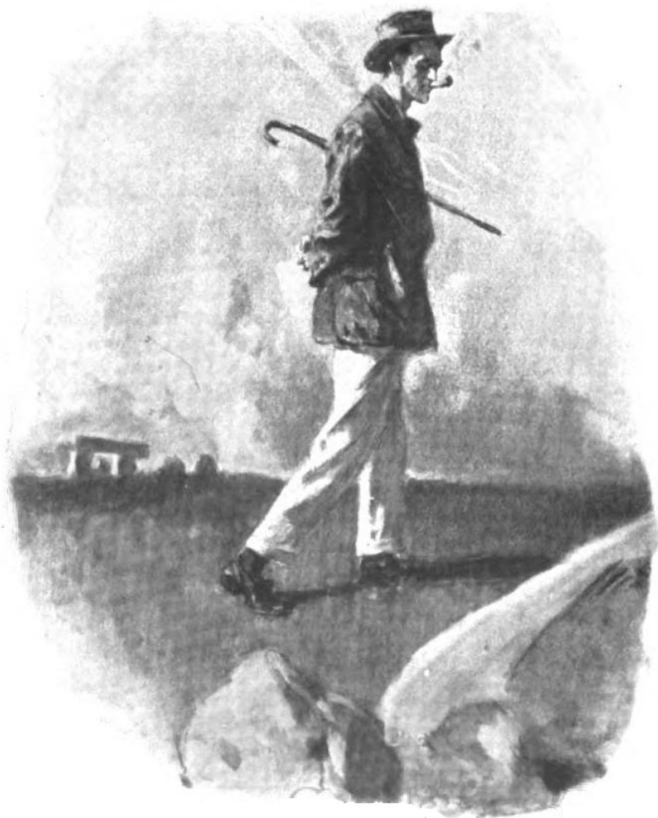
"HOLMES SPENT MUCH OF HIS TIME IN LONG WALKS AND SOLITARY MEDITATIONS."

The glamour and mystery of the place, with its sinister atmosphere of forgotten nations, appealed to the imagination of my friend, and he spent much of his time in long walks and solitary meditations upon the moor. The ancient Cornish language had also arrested his attention, and he had, I remember, conceived the idea that it was akin to the Chaldean, and had been largely derived from the Phœnician traders in tin. He had received a consignment of books upon philology and was settling down to develop this thesis, when suddenly to my sorrow, and to his unfeigned delight, we found ourselves, even in that land of dreams, plunged into a problem at our very doors which was more intense, more engrossing, and infinitely more mysterious than any of those which had driven us from London. Our simple life and peaceful, healthy routine were violently interrupted, and we were precipitated into the midst of a series of events which caused the utmost excitement not only in Cornwall,