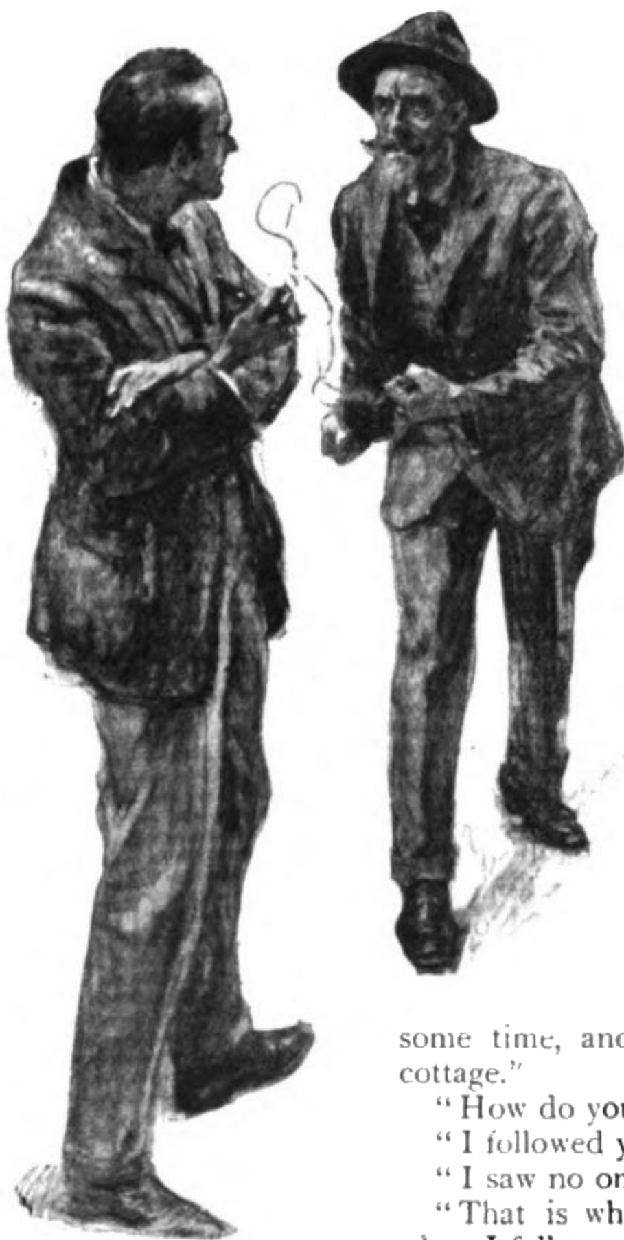
"HE SPRANG FORWARD WITH CLENCHED HANDS TOWARDS MY COMPANION."

"You then walked swiftly for the mile which separated you from the vicarage. You were wearing, I may remark, the same pair of ribbed tennis shoes which are at the present moment upon your feet. At the vicarage you passed through the orchard and the side hedge, coming out under the