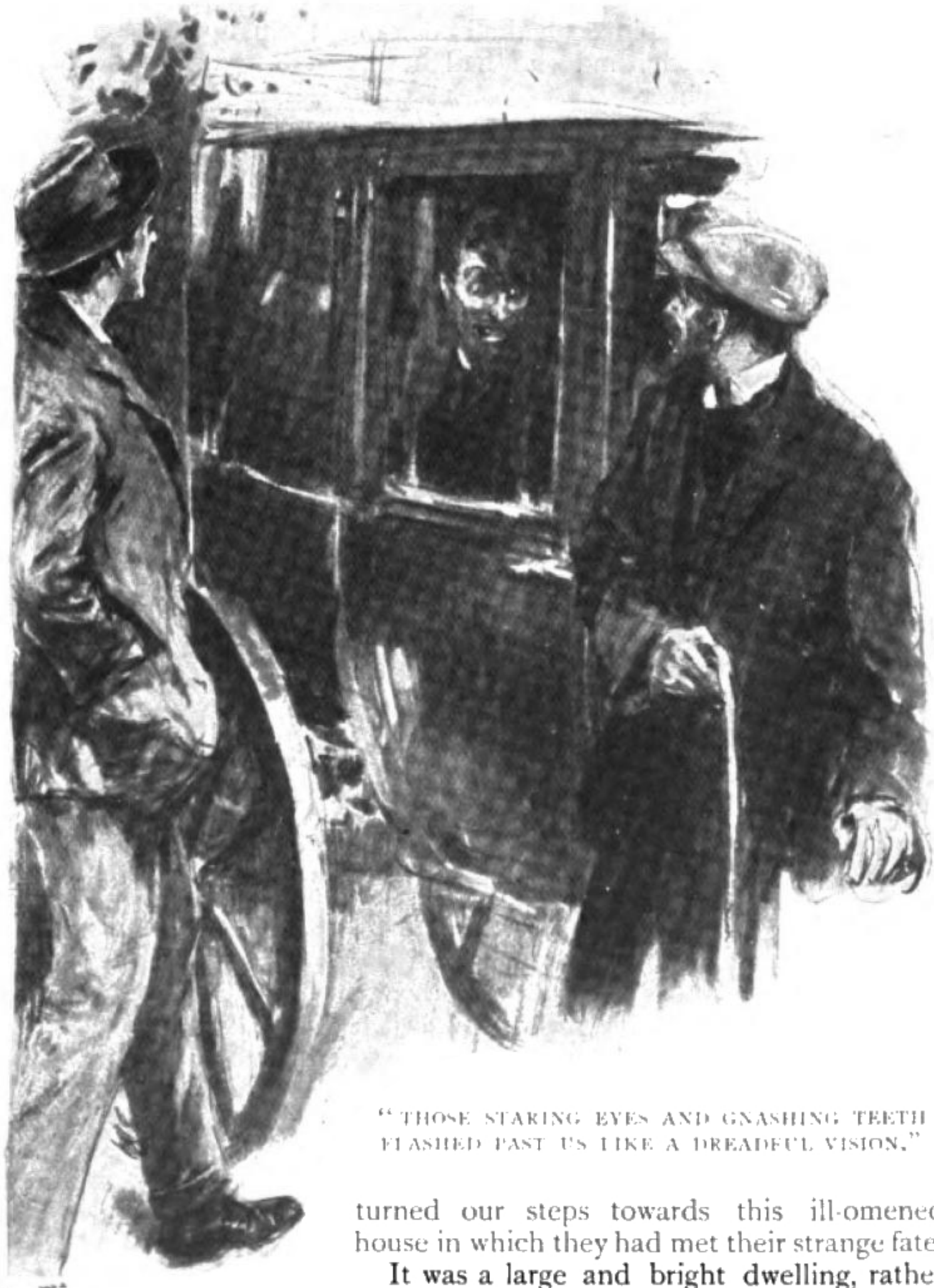
"THOSE STARING EYES AND GNASHING TEETH FLASHED PAST US LIKE A DREADEFUL VISION."

We looked with horror after the black carriage, lumbering upon its way. Then we