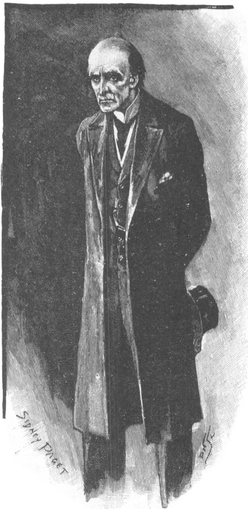
"PROFESSOR MORIARTY STOOD BEFORE ME."

I was sitting in my room thinking the matter over, when the door opened and Professor Moriarty stood before me.