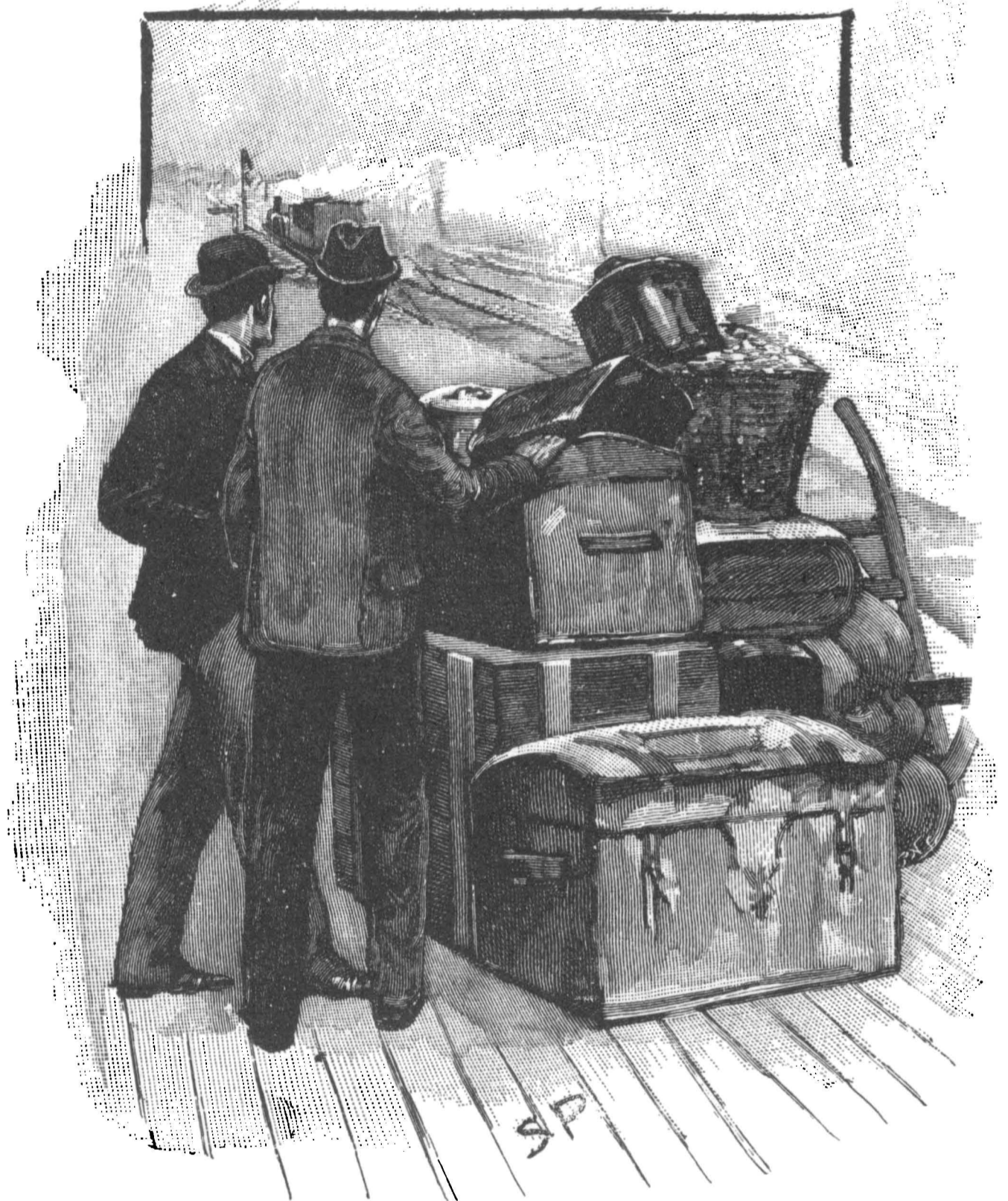
"IT PASSED WITH A RATTLE AND A ROAR."

We made our way to Brussels that night and spent two days there, moving on upon the third day as far as Strasburg. On the Monday morning Holmes had telegraphed to the London police, and in the evening we found a reply waiting for us at our hotel. Holmes tore it open, and then with a bitter curse hurled it into the grate.