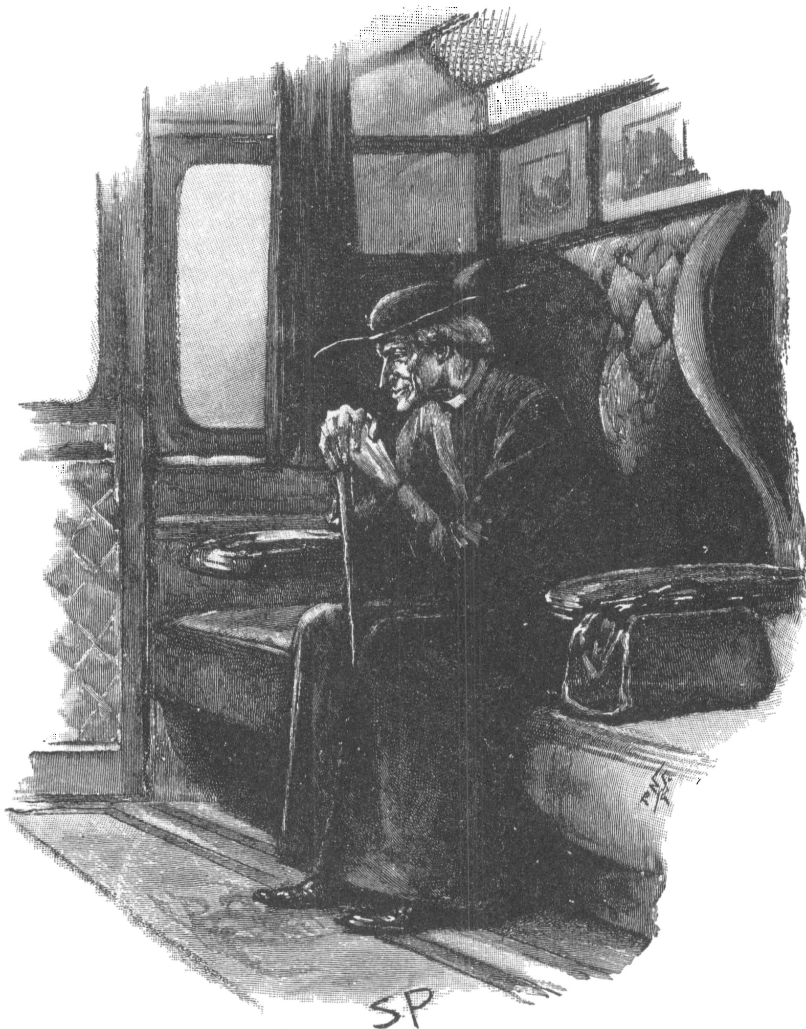
“MY DECREPIT ITALIAN FRIEND.”

“You haven’t seen about Baker Street, then?”