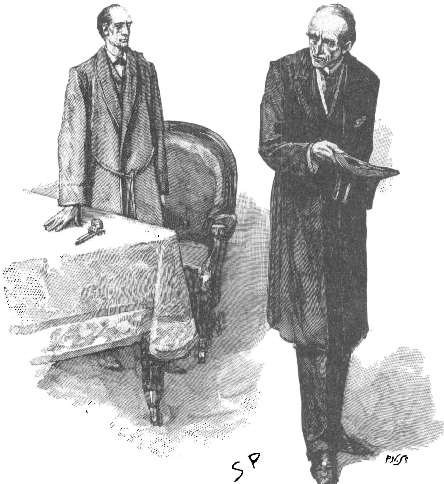
"HE TURNED HIS ROUNDED BACK UPON ME."

have the best of proofs that it would be so."