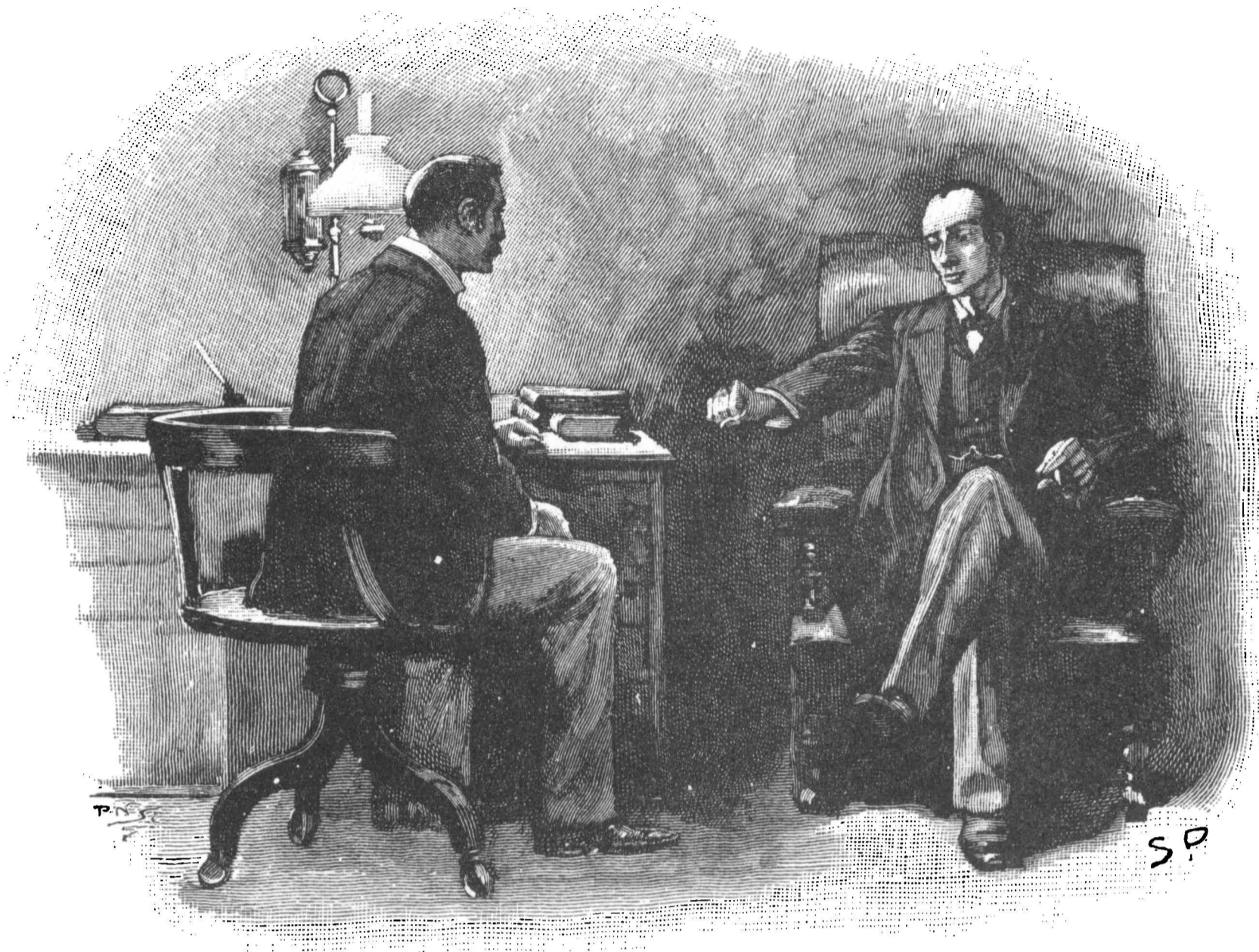
“TWO OF HIS KNUCKLES WERE BURST AND BLEEDING.”

aimless holiday, and something about his pale, worn face told me that his nerves were at their highest tension. He saw the question in my eyes, and, putting his finger-tips together and his elbows upon his knees, he explained the situation.