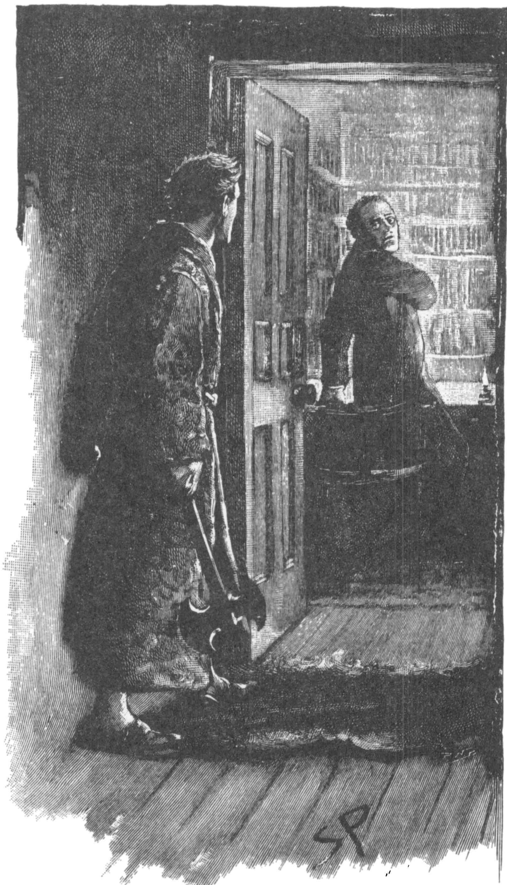
“HE SPRANG TO HIS FEET.”

any importance at all, but simply a copy of the questions and answers in the singular old observance called the Musgrave Ritual. It is a sort of ceremony peculiar to our family, which each Musgrave for centuries past has gone through upon his coming of age—a thing of private interest, and perhaps of some little importance to the archæologist, like our own blazonings and charges, but of no practical use whatever.’