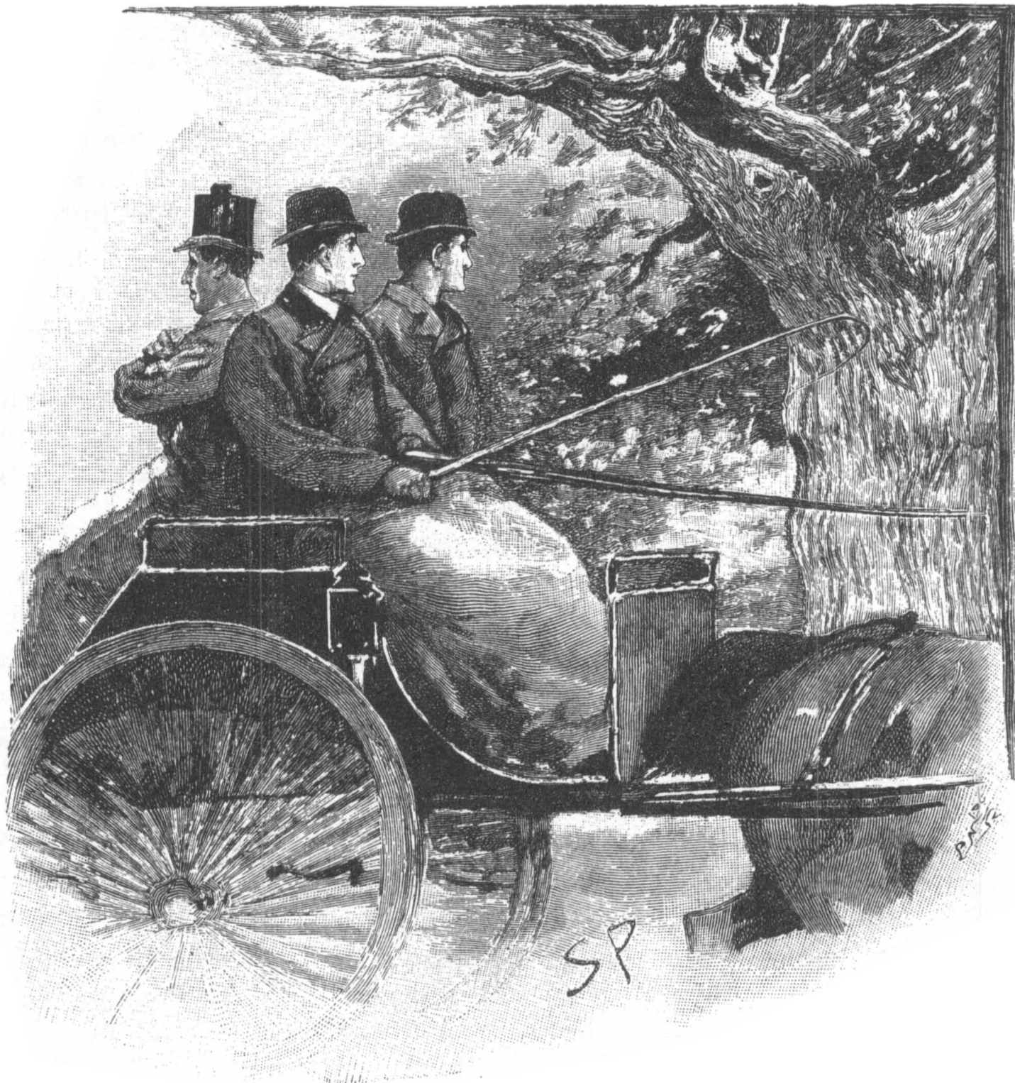
“IT HAS A GIRTH OF TWENTY-THREE FEET.”

“I was already firmly convinced, Watson, that there were not three separate mysteries here, but one only, and that if I could read the Musgrave Ritual aright, I should hold in my hand the clue which would lead me to the truth concerning both the butler Brunton and the maid Howells. To that, then, I turned all my energies. Why should this servant be so anxious to master this old