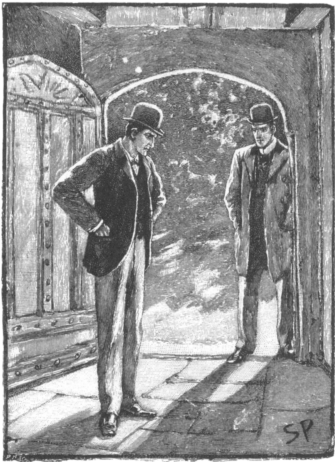
"THIS WAS THE PLACE INDICATED."

setting sun shone full upon the passage floor, and I could see that the old foot-worn grey stones, with which it was paved, were firmly cemented together, and had certainly not been moved for many a long year. Brunton had not been at work here. I tapped upon the floor, but it sounded the same all over, and there was no sign of any crack or crevice. But fortunately, Musgrave, who had begun to appreciate the meaning of my proceedings, and who was now as excited as myself, took out his manuscript to check my calculations.