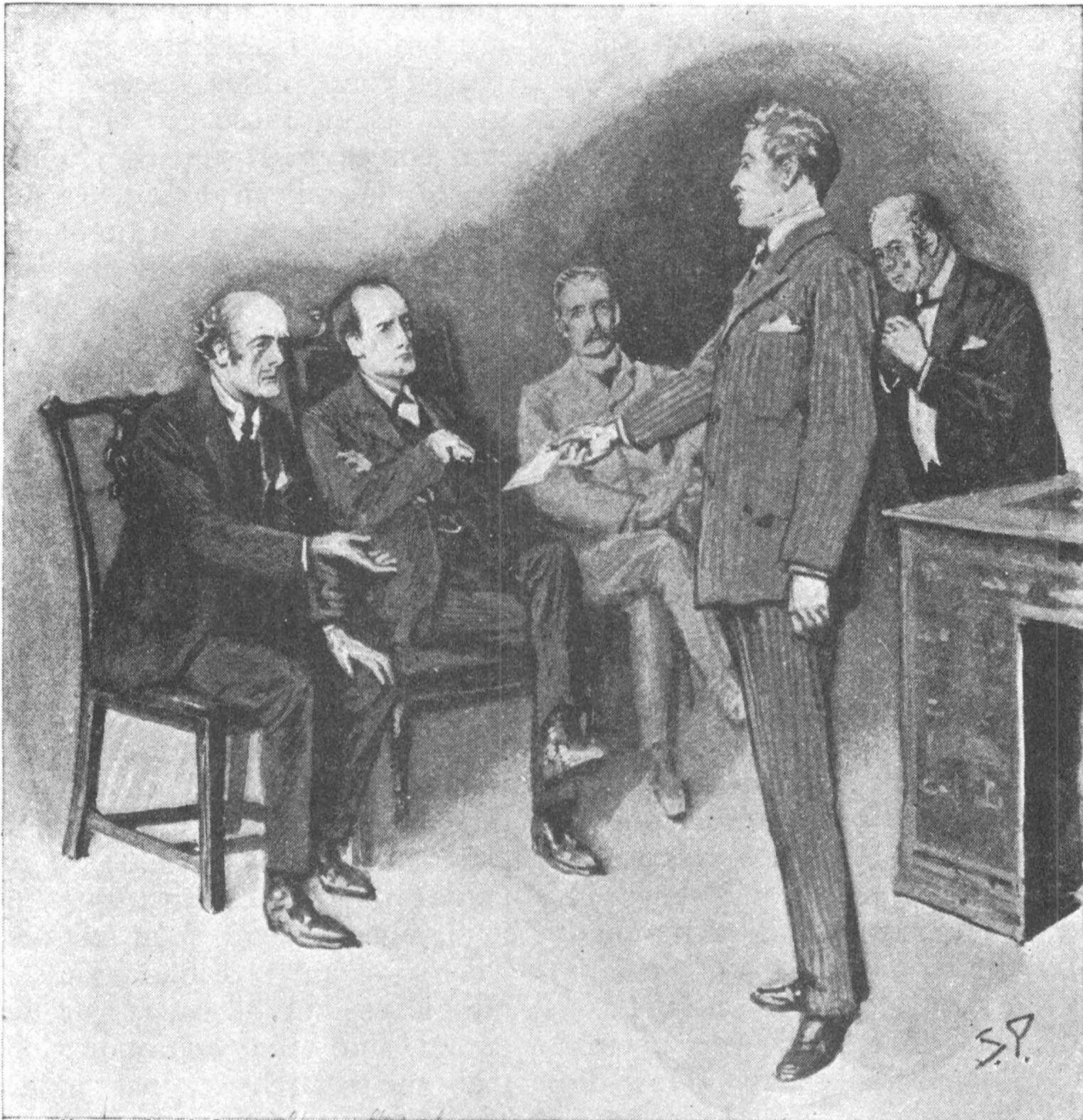
"HERE IT IS, SIR."

and I am going out to South Africa at once."