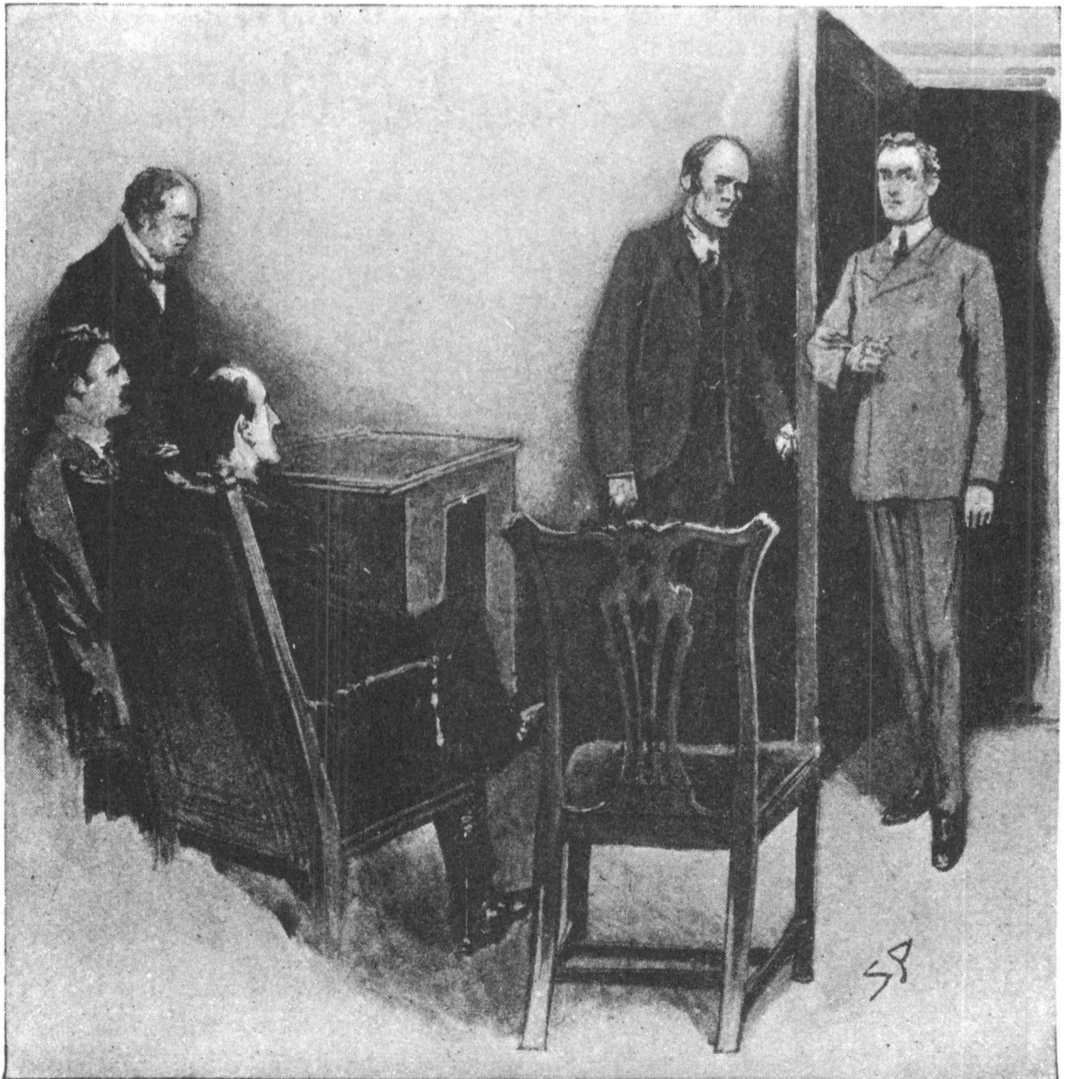
"AN INSTANT LATER THE TUTOR RETURNED, BRINGING WITH HIM THE STUDENT."

"No, but you have now," said Holmes. "Now, sir, you must see that after Bannister's words your position is hopeless, and that your only chance lies in a frank confession."