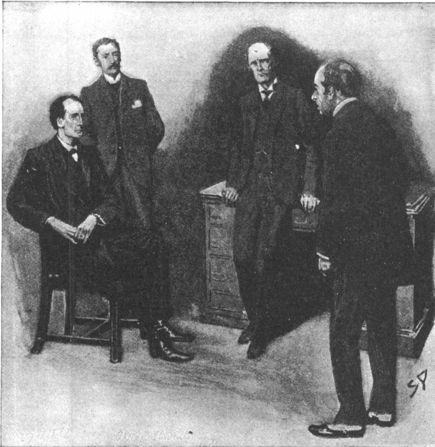
"HOW CAME YOU TO LEAVE THE KEY IN THE DOOR?"

"Thank you; that will do," said Holmes. "Oh, one more word. You have not mentioned to any of the three gentlemen whom