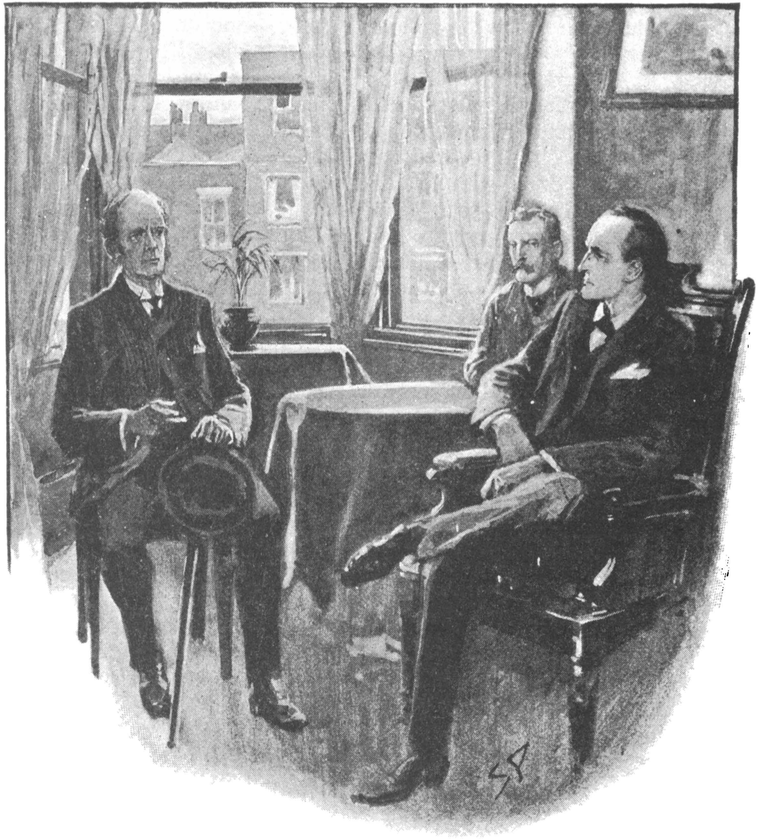
"HOW COULD YOU POSSIBLY KNOW THAT?"

"Bannister was very much upset by the incident. He had nearly fainted when we found that the papers had undoubtedly been tampered with. I gave him a little brandy and left him collapsed in a chair while I made a most careful examination of the room. I soon saw that the intruder had left