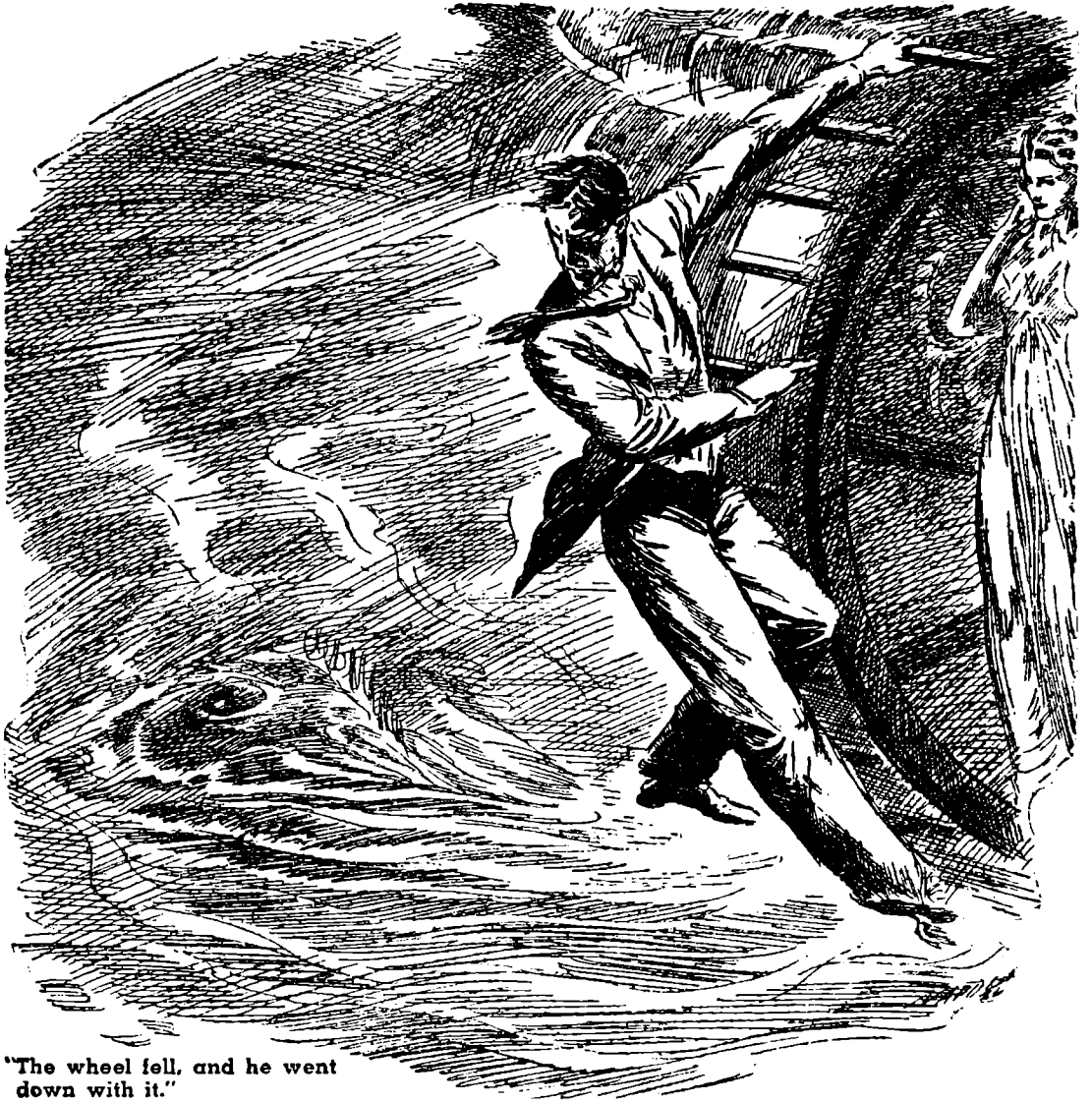
"The wheel fell, and he went down with it."

ing with hidden violence and cruelty. I sensed medieval savagery in the air. Maybe it was the olive-trees, twisted and maimed like cripples, clawing for life in the rocky soil. Maybe it was virago-faced old women who wore amulets on their withered arms and who crossed themselves against the Evil Eye if you aimed a camera at them.