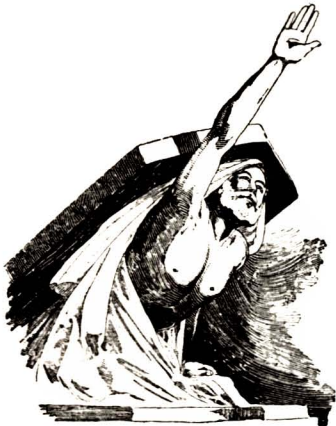
JULES VERNE'S TOMBSTONE AT AMIENS PORTRAYING HIS IMMORTALITY