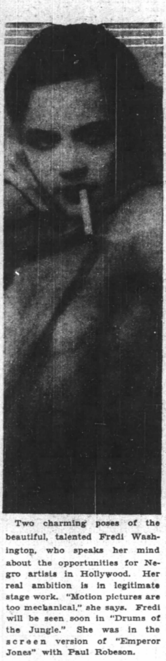
Two charming poses of the beautiful, talented Fredi Washington, who speaks her mind about the opportunities for Negro artists in Hollywood. Her real ambition is in legitimate stage work. "Motion pictures are too mechanical," she says. Fredi will be seen soon in "Drums of the Jungle." She was in the screen version of "Emperor Jones" with Paul Robeson.