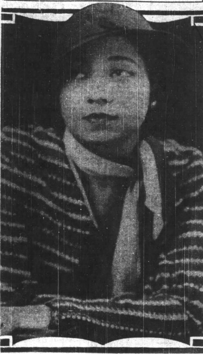
ETTA MOTEN Popular stage, screen and radio star, who sang for the President and his party during the inauguration, will be one of the sterling artists to appear on the midnight bill being arranged for the mammoth N. A. A. C. P.—Pittsburgh Courier National Defense Fund benefit.