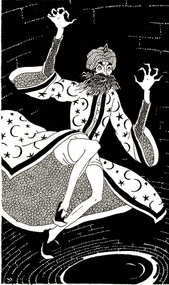
His long fingers, like great white claws, clutched at the wall as he fell

vealed. His face grew painfully haggard and thin, so thin that his skin was as parchment stretched over a skeleton. I shivered as the simile came