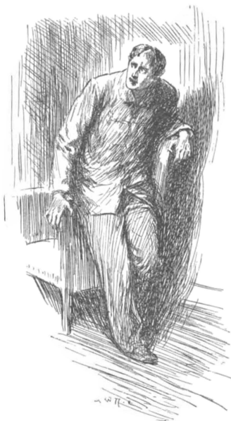
"I expected every moment to hear muffled footsteps on the stairs."

There was something wonderfully straightforward and prosaic in all this: here were no Jacobean houses oak-panelled and surrounded by weeping pine-trees, and somehow the very absence of suitable surroundings made the story