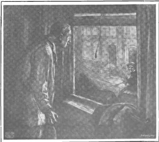
"'Just room for one inside, sir,' he said."

"You had put me in the front room on the third floor, overlooking the street—a room which I thought you generally occupied yourself. It was a very hot night, and though there had been a moon when I started to my party, on my return