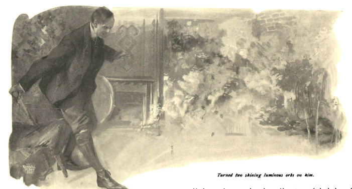
Turned two shining luminous orbs on him.

"Yes. Perhaps looking at the eyes of a cat would help me to see what I miss. Many thanks for the hint."