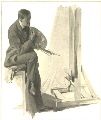
"It's so like you, but it just isn't you."

however small, of any disorder of the nerves. Yet Dick was altogether an abnormal fellow; the history he had just been recounting was abnormal—those weeks of depression followed by the sudden snap in his brain which had apparently removed, as a wet cloth removes a stain, all the memory of his love and of the cruel bitterness that followed. Abnormal, too, was his