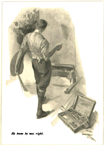
He knew he was right.

that he put in, would cause what he had painted to live and shine, just as it is the layers of dusk that fall over the sky at evening which make the stars to sparkle there, jewel-like. His scheme was assured: he had hung his constellation—the figure of Lady Madingley—