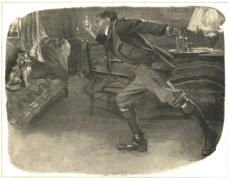
He threw the glass he carried at the cat.

Now the presence of a cat was a thing that usually produced in Dick a feeling of deadly faintness, yet at this moment, as he looked at the cat and the cat at him, he was conscious of no such feeling, and put down the absence of it, in so far as he consciously thought about it, to the fact that he was in the open air, not in the atmosphere of a closed room. Yet last night out here, the cat had made him feel faint. But he hardly