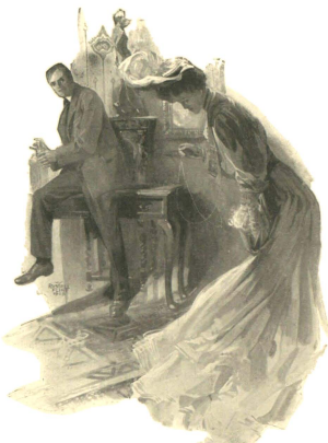
"No drink of any kind on this Sahara of a morning?"

going down to a small cottage of his near Godalming, where he had put up in the garden a sort of outdoor studio, an erection betwixt a room and a mere shelter, with the side to the north entirely open, and flanked by this green trellis, which was now one immense constellation of purple stars. Framed in this, he knew well how the strange pale beauty of his sister