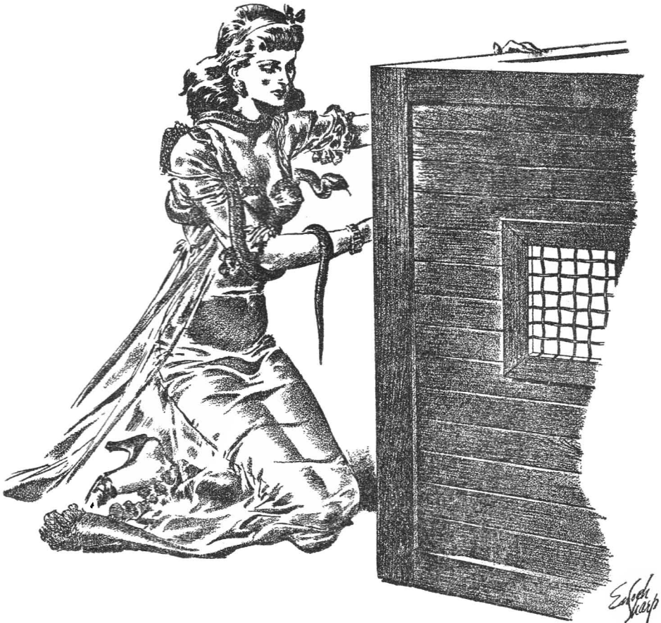
She was crouching in front of the box, and I knew that she was opening it . . .

Isabel indicated the one she was stroking, and said, "Silissu." Then she glided over to the flower fancier, and said, "Sassisac. See?"