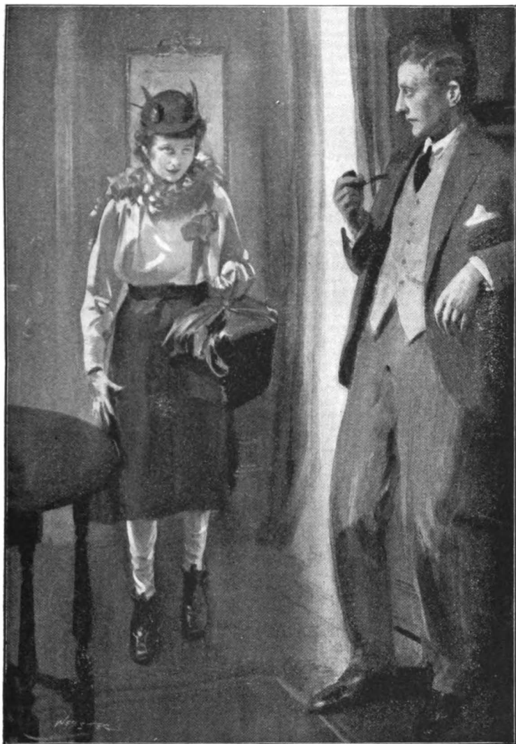
Stammering awkwardly, he stumbled back a few paces—bumped into a bookcase, and stood aghast. The girl, rather breathless and blinking her eyes very fast, presented an astonishing picture.