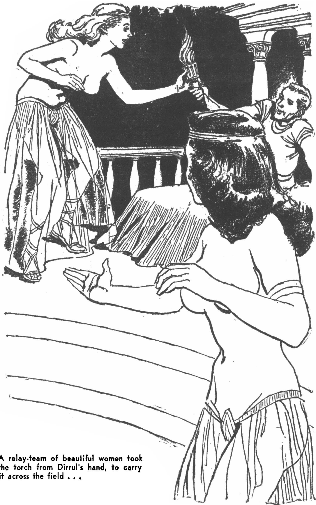
A relay-team of beautiful women took the torch from Dirrul's hand, to carry it across the field . . .