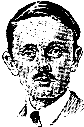
CLARK ASHTON SMITH

My imagination was excited, and I began to indulge in some rather overheated fantasies. But the wildest of these was a homely commonplace in comparison with the thing that happened when I took a single step forward in the vacant space immediately between the two boulders. I shall try