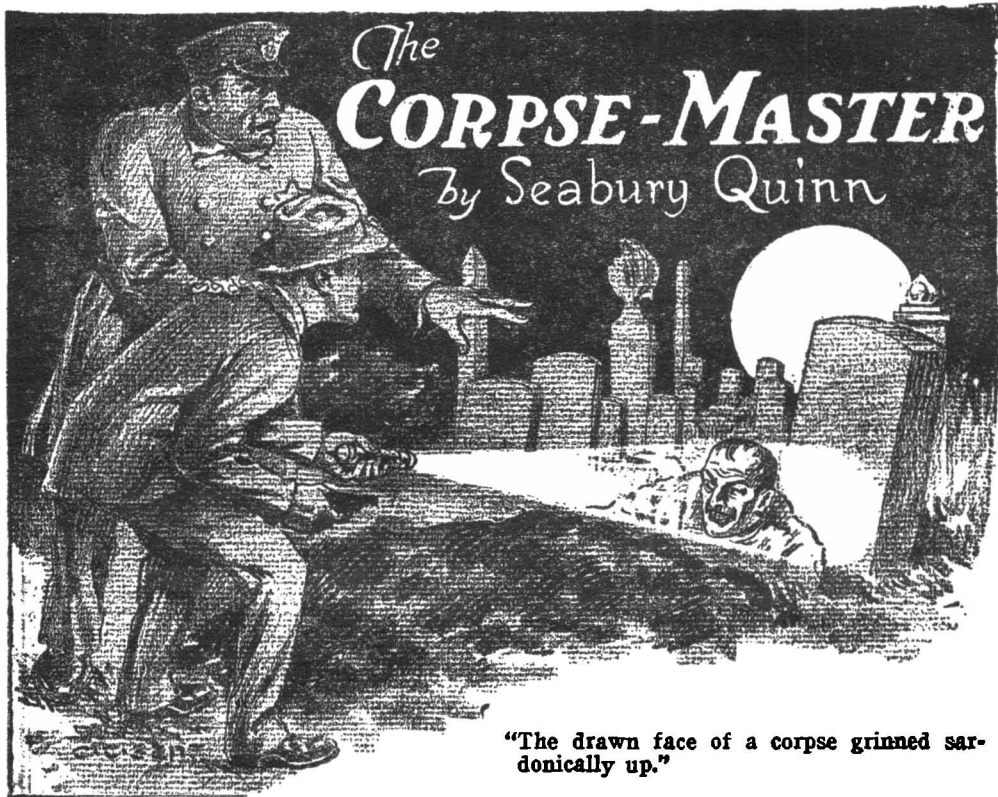
"The drawn face of a corpse grinned sardonically up."

T HE ambulance-gong insistence of my night bell brought me up standing from a stuporlike sleep. For something like the millionth time I cursed the poor judgment which had led me to study medicine, as I shoved my toes into a pair of slippers and draped a bathrobe about my rather matronly figure, then, still half blinded by lingering sleep, began feeling my way down the stairs, one groping foot tentatively preceding the other in the mechanics of descent.