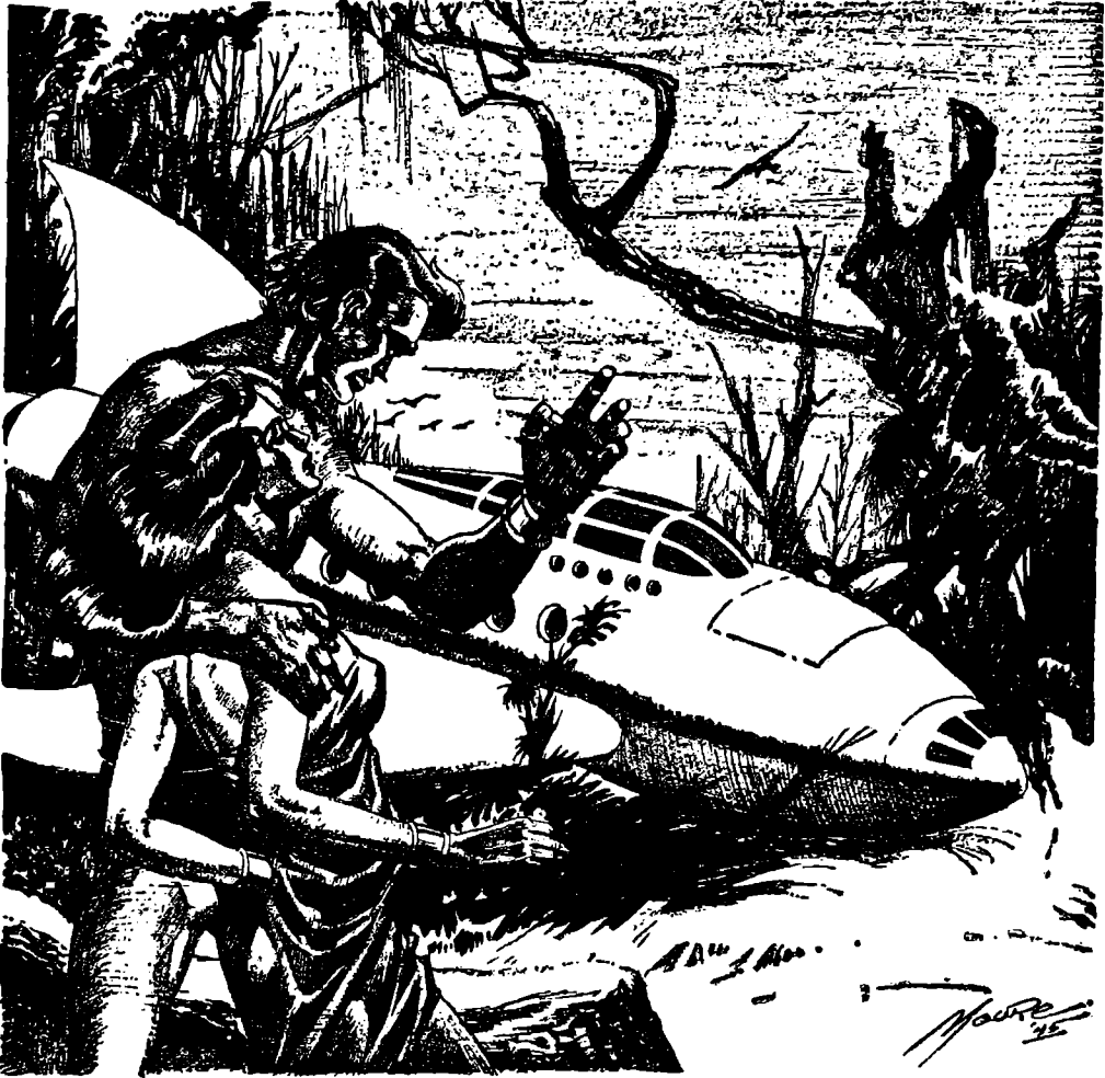
Ahead of them lay the ship. Sim could not believe they were so near.

D URING THE NIGHT, Sim was born. He lay wailing upon the cold cave stones. His blood beat through him a thousand pulses each minute. He grew, steadily.