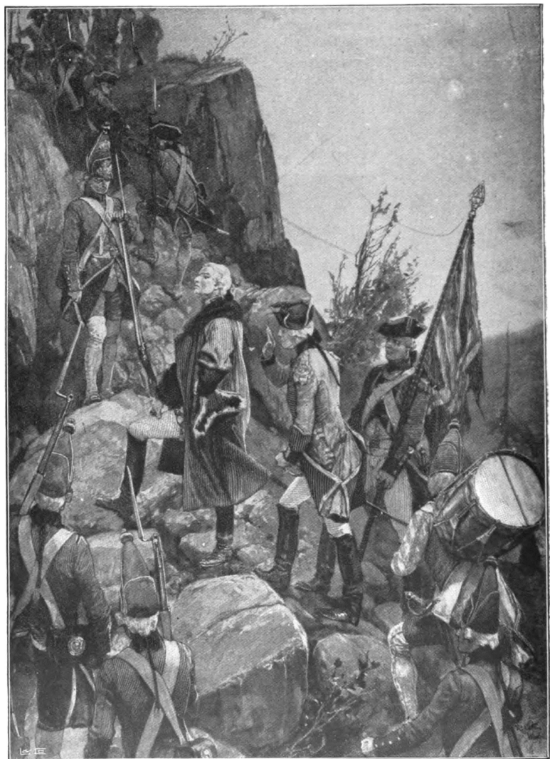
GENERAL WOLFE CLIMBING THE HEIGHTS OF ABRAHAM.