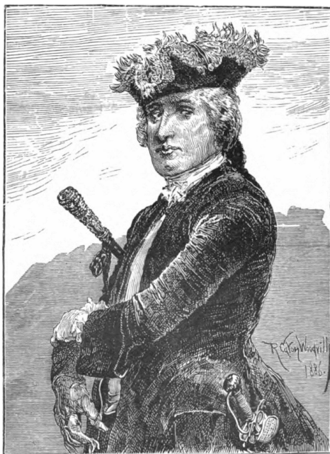
THE MARQUIS DE MONTCALM DE SAINT-VÉLAN.

fell before the expeditions launched by Pitt; in battle and chase the French navy was swept from the sea; in Germany the