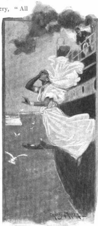
"SHE MOUNTED THE POOP AND JUMPED INTO THE WATER."