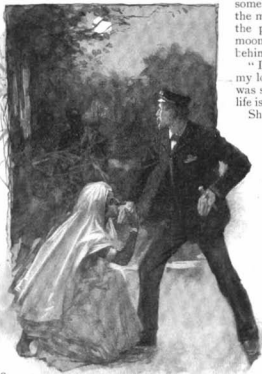
"TAKING THE FINGER THAT HELD THE RING, SHE BIT IT CLEAN THROUGH."

"Yes," he went on, "I'm all right, and you shall tell me how it happened to you