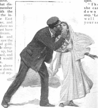
"I THREW ASIDE HER VEIL AND KISSED HER."

"Then she came down a step. 'Look well to yourself