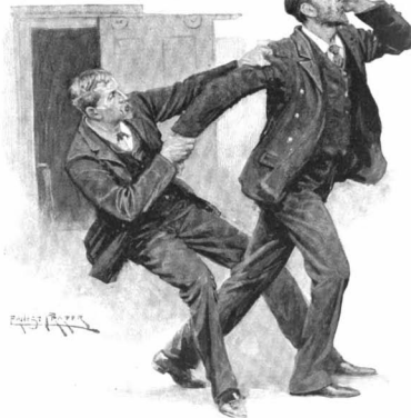
"HE DRAGGED ME ALONG AS EASILY AS A CHILD."

But between her and me came the memory of Mary, and the promise