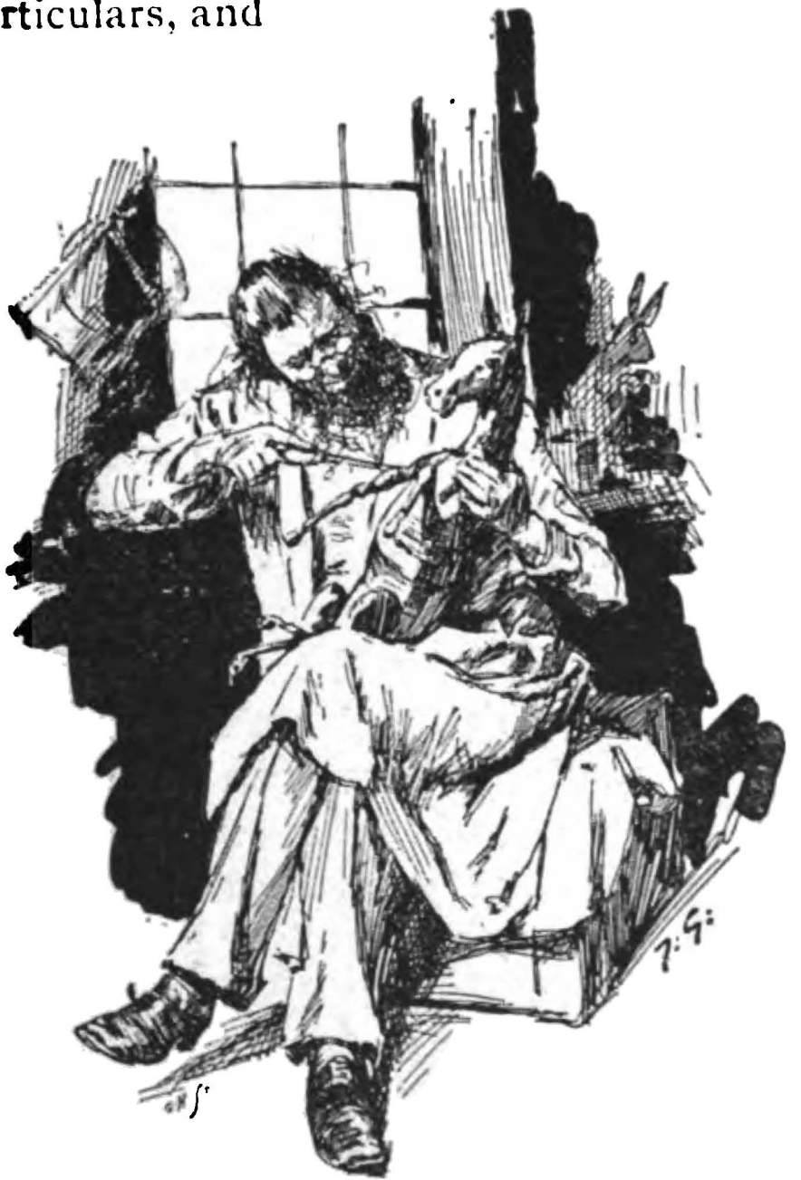
"HE HAD CONTRIVED A MECHANICAL DONKEY."

"This story," commenced MacShaugnassy, "comes from Furtwangen, a small town in the Black Forest. There lived there a very wonderful old fellow named Nicholaus Geibel. His business was the making of mechanical toys, at which work he had acquired an almost European reputation. He made rabbits that would emerge from the heart of a cabbage, flop their ears, smooth their whiskers, and disappear again; cats that would wash their faces, and mew so naturally that dogs would mistake them for real cats, and fly at them; dolls, with phonographs concealed within them, that would raise their hats and say, 'Good morning; how do you do,' and some that would even sing a song.