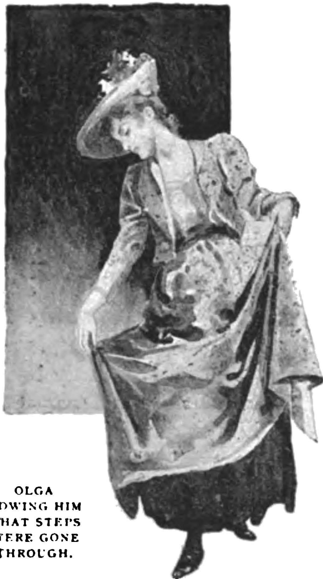
OLGA SHOWING HIM WHAT STEPS WERE GONE THROUGH.

“A month later another ball took place in Furtwangen. On this occasion it was given by old Wenzel, the wealthy timber merchant, to celebrate his niece’s betrothal, and Geibel and his daughter were again among the invited.