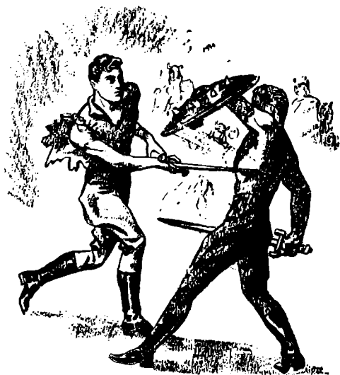
The sword bit into Heysing's side

The Nazi swayed, dropping his sword and then falling heavily. His helmet hit the stone floor with a resounding clang. He lay still.