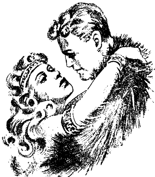
Fallon kissed the daughter of Thor

that touch completed the demoralization of his will. Fallon's arms went around the daughter of Thor and he bent and kissed her parted red lips.