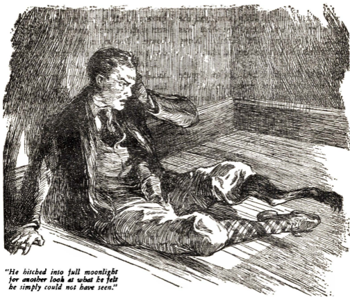
"He hunched into full moonlight for another look at what he felt he simply could not have seen."

way to derisive laughter, but the taxi man's face, distorted with grief, restrained him from giving voice to his amusement at the absurd theory.