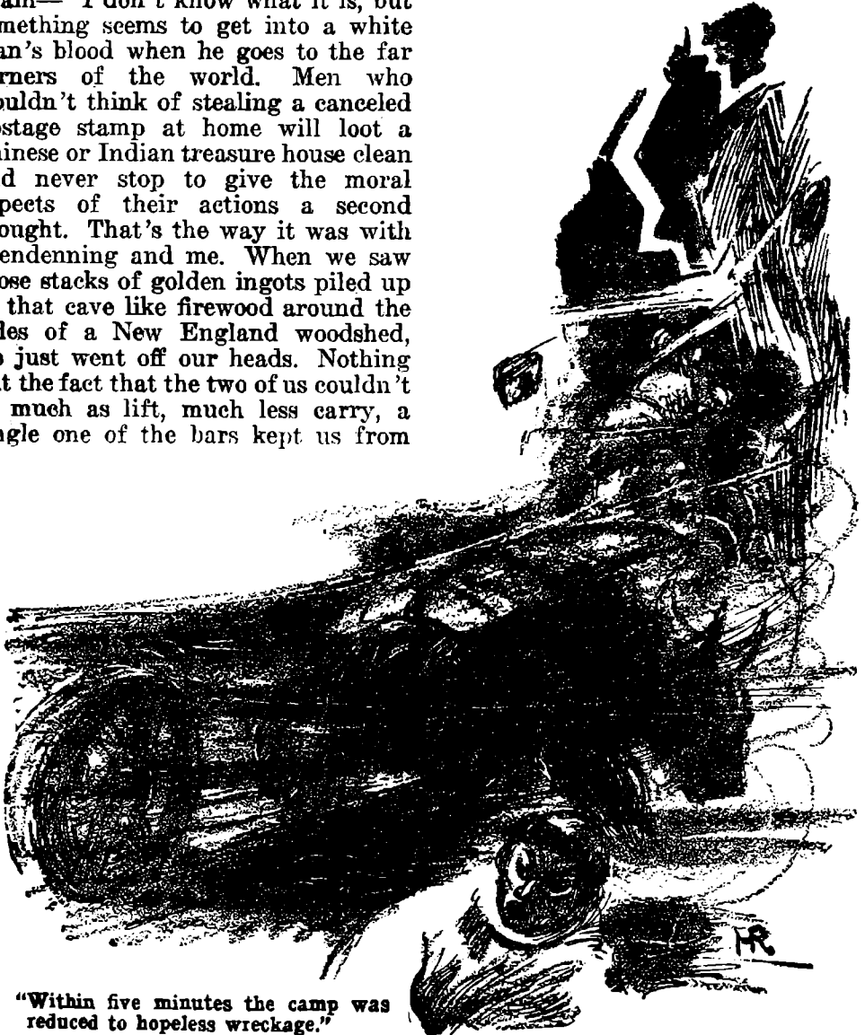
"Within five minutes the camp was reduced to hopeless wreckage."

"When we saw we couldn't carry any of it off we were almost wild. Scheme after scheme for getting away with the stuff was broached, only to be discarded. Stealth was no go, for we'd be sure to be seen if we tried to lead our bearers down the tunnels; force was out of the question, for the lamas outnumbered us ten to one, and the ugly-looking knives they wore