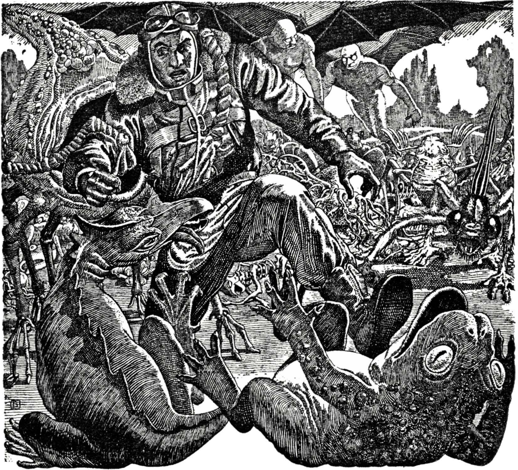
A headless thing with ropy arms and a puckered, mouth-like orifice tried to drag Morris down.

last resort would summon other planes by radio, from one of the American bases in California, to intercept Sakamoto.