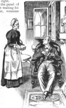
"'MORE DEVIL'S PICTURES, MR. WALLER,' SHE SAID."

"Just so," stammered Hereward. "Quite—quite natural. Will you—"