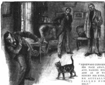
"HEREWARD TURNED HIS FACE AWAY, AND, RAISING HIS ARM AS IF TO SCREEN HIS EYES, HE ACTUALLY CALLED FOR HELP."

Brooker. You must really forgive my unpardonable remissness, but I—I have been very far from well just lately. What can I offer you to drink—brandy? whiskey? rum? Or can I tempt you with a glass of champagne?"