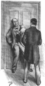
"HE SPRANG BETWEEN THE DOOR AND ME."

"Durrant, when I lied to Miss Macreham, in the first horror of that dreadful moment, tearing the book into a dozen fragments, I threw them, one by one, into the fire."