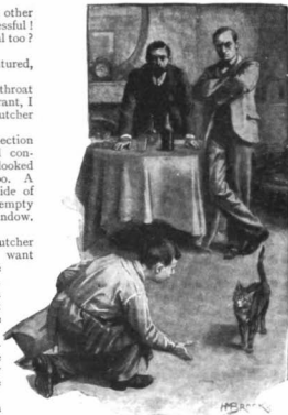
"THAT PERFDIOUS BUTCHER BOY ALLURED THE TRUSTFUL TABBY."

"Well, sir, the other day a party gave me a cat, and half a crown to do for it; and when I'd done for it, I found that it was the party's cat what lived next door to this here first party—an old lady's cat it was. And didn't she go on when she