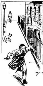
"THE BUTCHER BOY RAN DOWN THE STREET AS IF SATAN WERE AT HIS HEELS."

He produced the knife. It was a knife, a murderous-looking weapon.