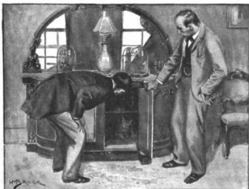
"LOOK!" HE SAID, REFERRING TO THE CAT, "THAT IS MRS. MACRECHAM."

I followed him across the room with feelings which I experience some difficulty in describing. As he produced a key from his waistcoat pocket, and, with shaking fingers, fitted it into the lock of the side-